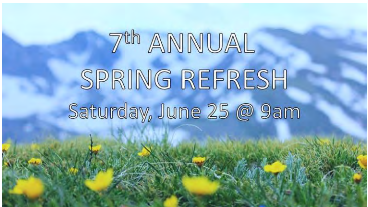
The Spring Refresh has been rescheduled for June 25. All the work projects and clothing swap will also