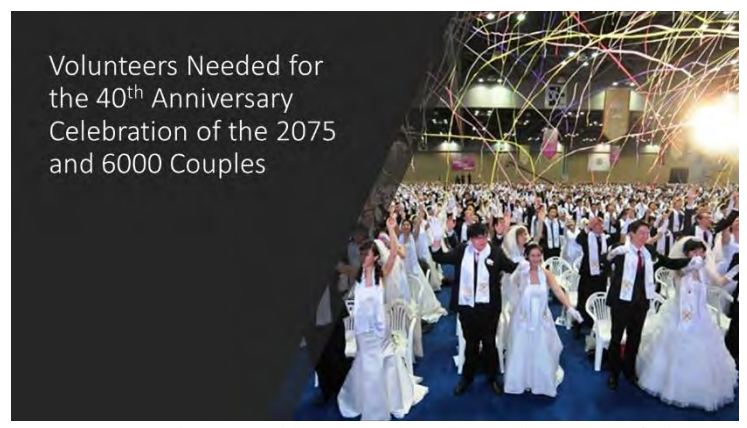
We are preparing to celebrate the 40th Anniversary of the 2075 and 6000 couples from 1982. We are looking for volunteers so can help with moving chairs, setting up tables in the chapel, picking up food, etc. If you are able to help, please let Rev. Richard or Marjorie Buessing know.