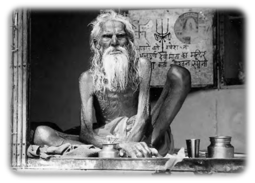
"inner asceticism" requires the practice of extreme self-denial. This extreme form of asceticism is what we are referring to here.

In either case, for many who believe in an achievable sense of earthly human perfection, the ultimate goal and process to achieve it requires a devotion to a life of asceticism. The German sociologist Max Weber discerned between two kinds of asceticism: "worldly asceticism" and "inner asceticism". In worldly asceticism, people discipline themselves to live what they believe to be a holy life, but they do not withdraw from society and "the world". This kind of "worldly asceticism" is essential to enable all people to purify themselves from temptation and sin. However, what Weber called