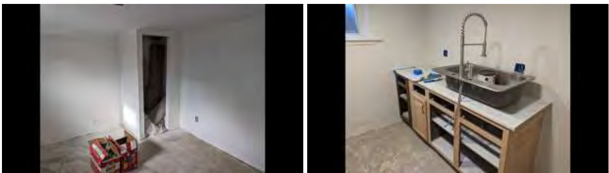
A big thank you to our team of volunteers for the ongoing renovation work across the street. Cabinets, countertops, and painting happened this week, with more coming soon.