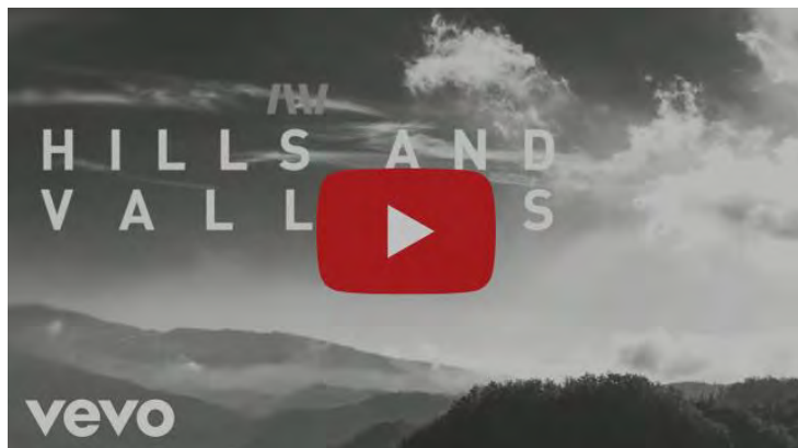
Offering Song: Hills and Valleys by Tauren Wells