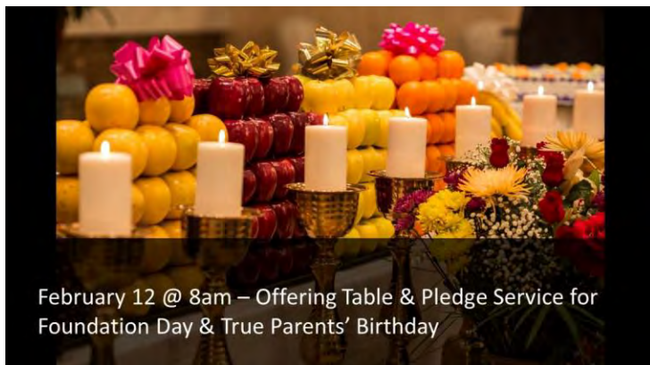
February 12 @ 8am – Offering Table & Pledge Service for Foundation Day & True Parents' Birthday

The Lifeboat was recently able to help two families in our community with seriously-needed financial help to get through this difficult time of sickness and other problems. Next time it could be your family which needs help. Please donate to the Lifeboat. If you want to donate by check, please write it payable to: "The Lifeboat" and not to the Church. Thank you so much for your generous support for our families.