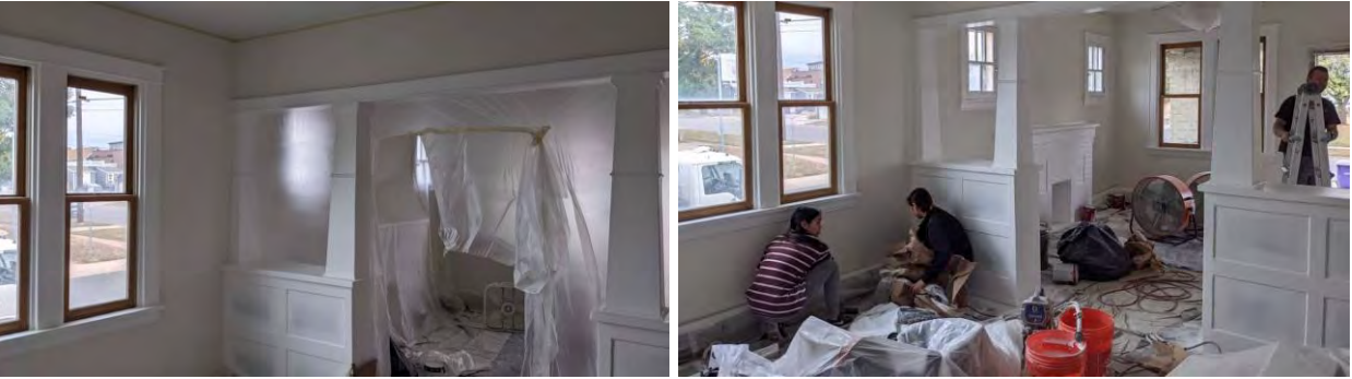
This week, we finished painting the new CARP center. A huge thank you to everyone that helped,