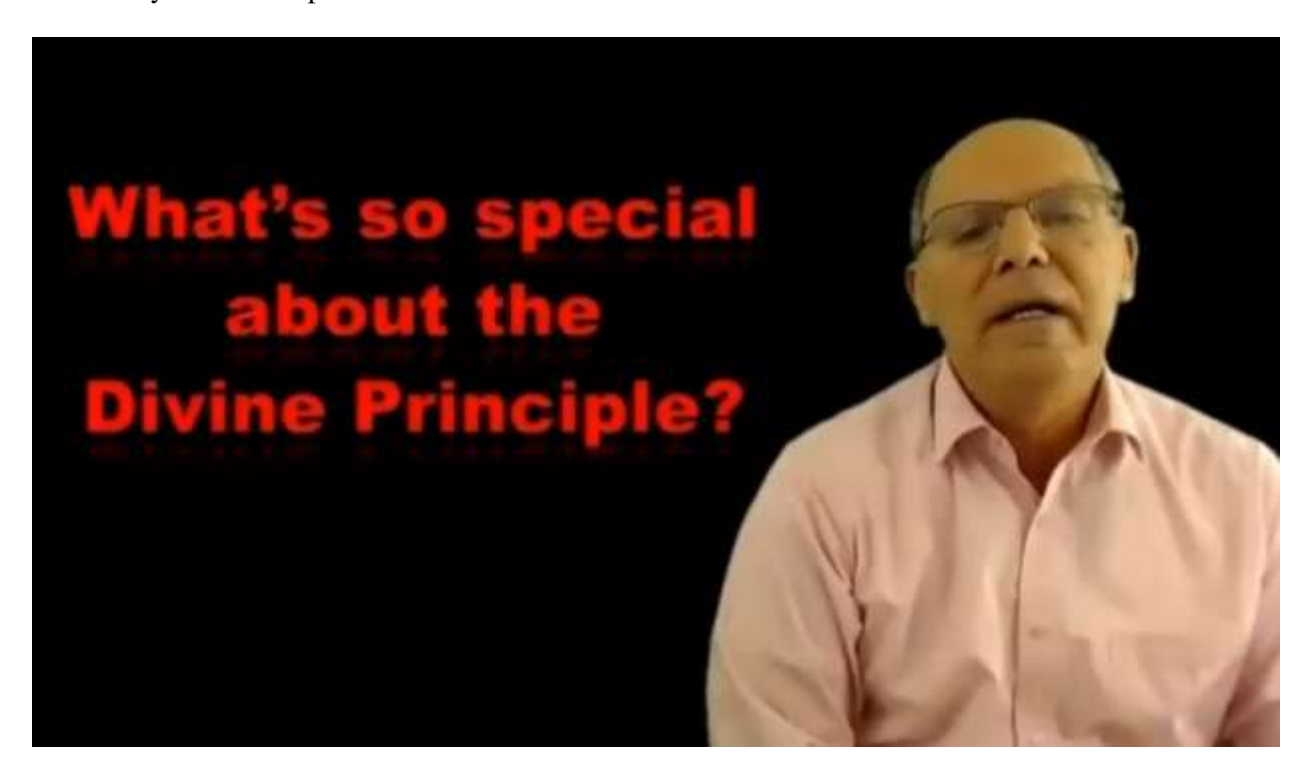
Caption: WHAT'S SO SPECIAL ABOUT THE DIVINE PRINCIPLE?

One of the reasons that we have this kind of situation is that times have changed; and, in my father's lifetime and before that, many generations, when you had a difficulty in your life, with your marriage, with your family, with your finances, with your teenagers, whatever it was, you went to find the highest building in town, which was the steeple of the church. You talked to the pastor, the priest, the rabbi, the imam; because, they were considered the wisest, most knowledgeable, educated, informed people in town. They were the experts.