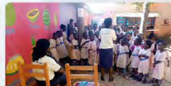
Reduced Child Marriage