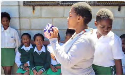
Fighting Period Poverty