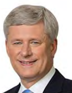
H.E. Stephen Harper