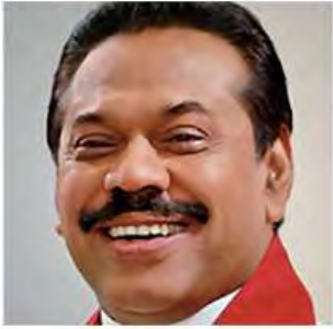
H.E. Mahinda Rajapaksa