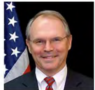
Amb. Christopher Hill