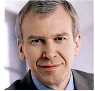
H.E. Yves Leterme