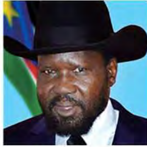
H.E. Salva Kiir Mayardit