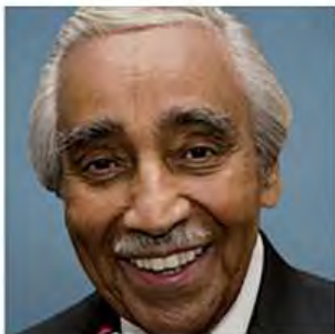
H.E. Charles Rangel