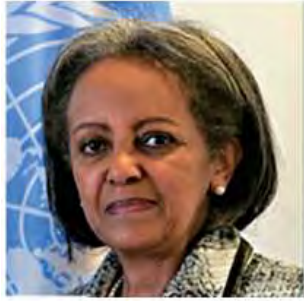
H.E. Sahle-Work Zewde