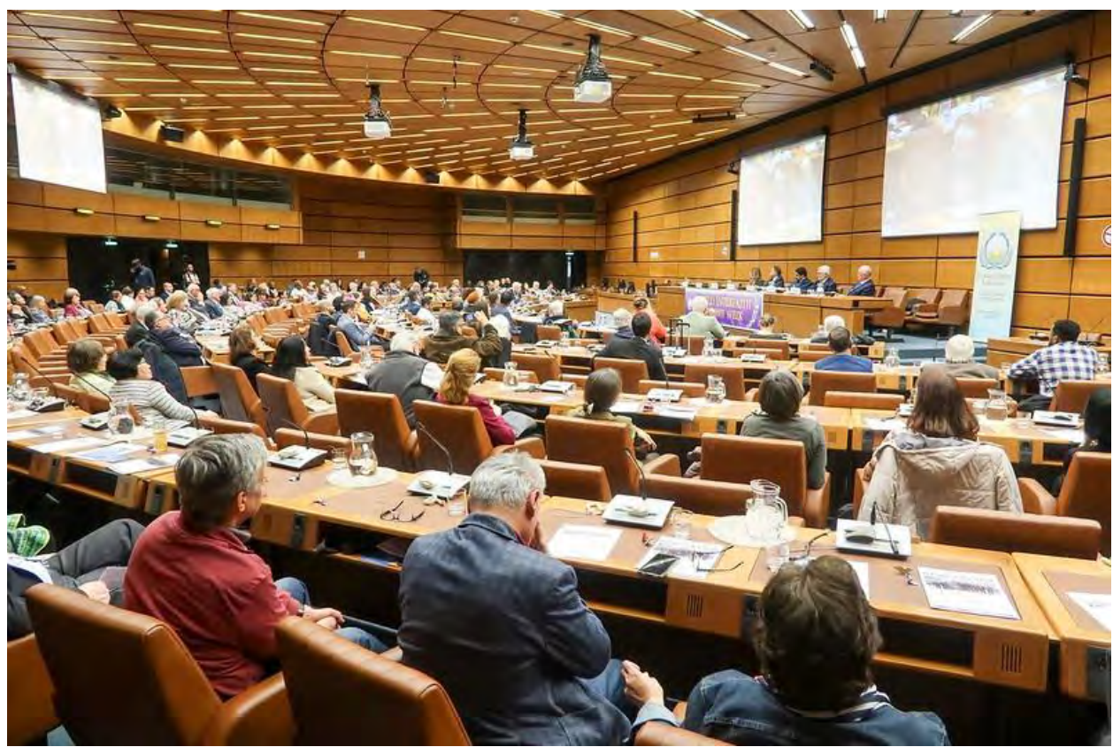
The event took place at the Vienna International Centre (United Nations)