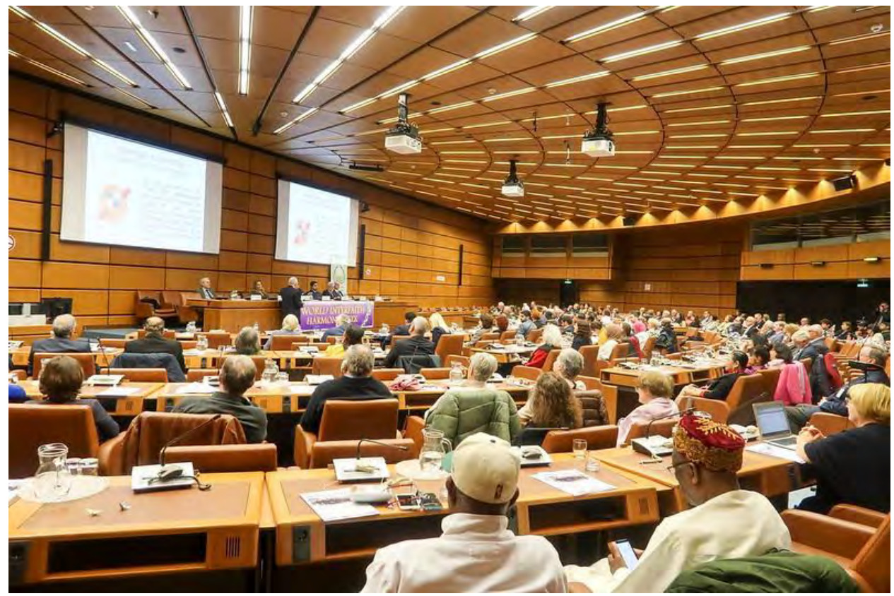
200 guests attended the conference celebrating World Interfaith Harmony Week at the UN in Vienna

Regarding his home country, he said the Pakistani Constitution protects the rights of minorities. The problems besetting Pakistan, however, are due to the mindset of narrow-minded conservatism. In conclusion, he called for a movement of love to overcome this mindset and to revive the times when Christian, Jewish and Muslim faiths lived together in harmony and respect.