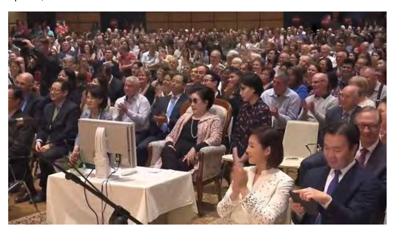
April 30, at the Austria Center, Vienna

Today beginning at 12 noon, a victory celebration to honor True Parents' success in Vienna was held with a huge crowd of thousands of members – practically all those who had come from all across the European super-region, from as far away as the Middle East and Moscow. Moreover, leaders from Korea, Japan and the US had also made the journey and were present.