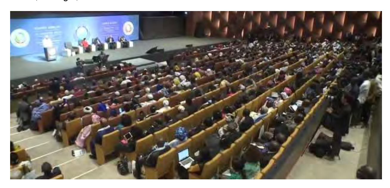
[This report is compiled quickly based on notes, and while it strives to convey the spirit and quality of the occasion, some of the accounts of speeches are truncated; the reader is advised to watch the video recording of the opening plenary session if possible.]