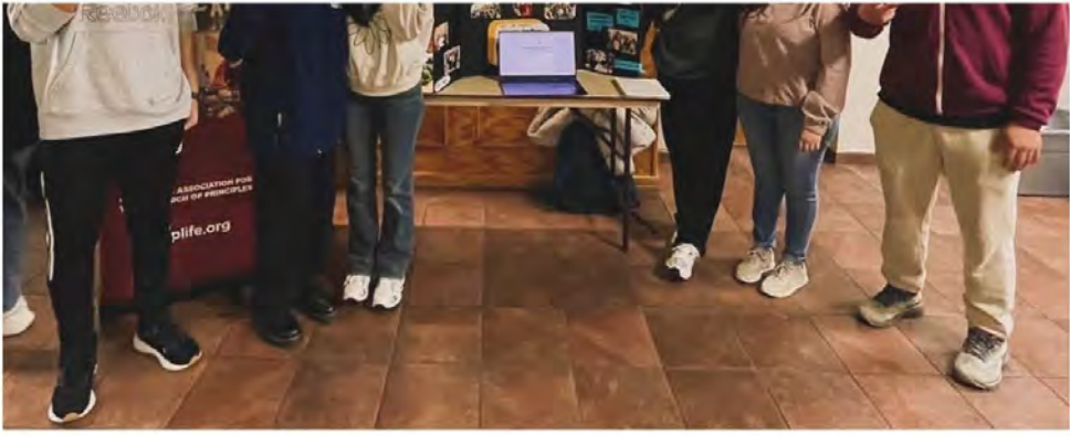
University of Texas, Arlington; Arlington, TX