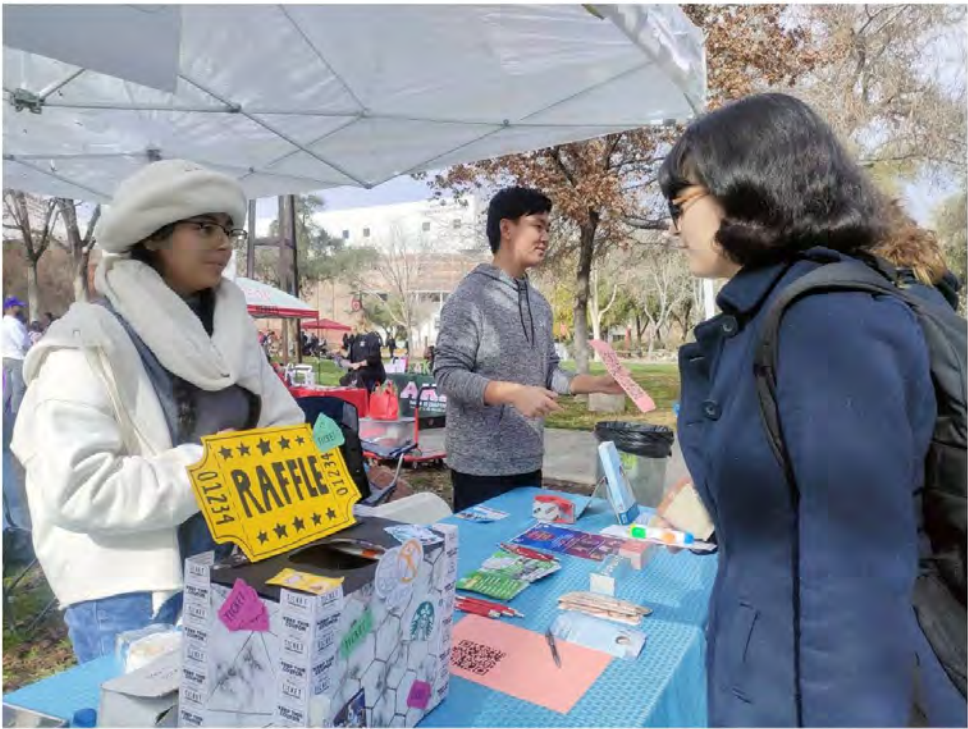
University of Nevada, Las Vegas; Las Vegas, NV