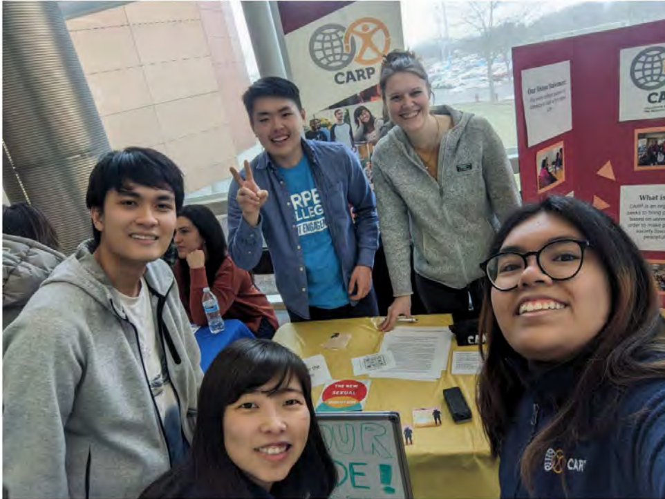
Harper College; Palatine, IL