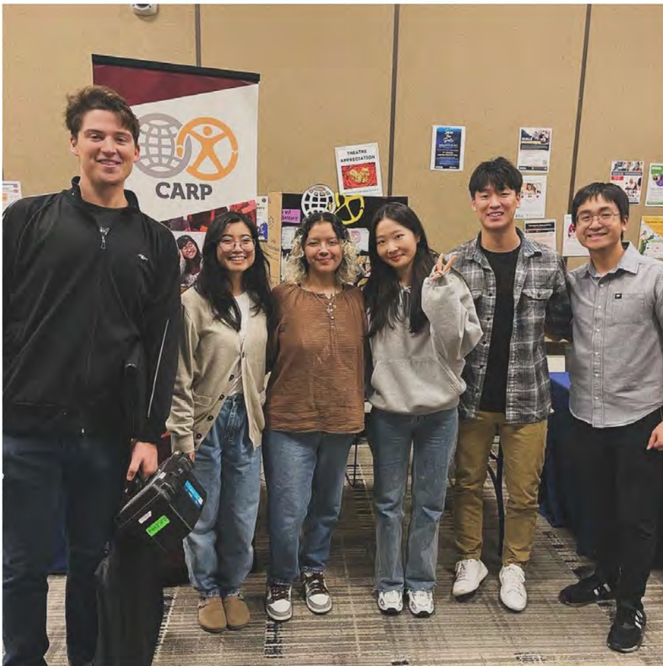
Dallas College, North Lake Campus; Irving, TX