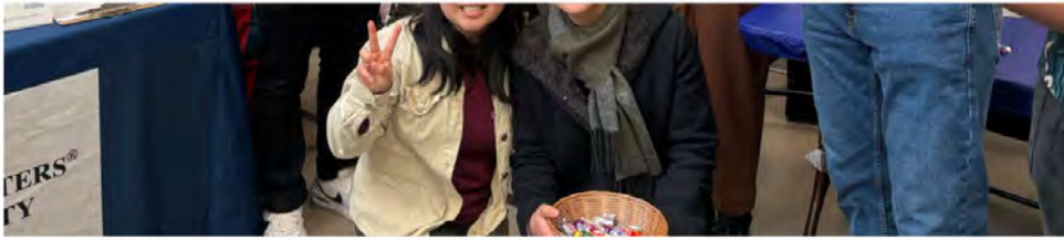
Montgomery College; Rockville, MD