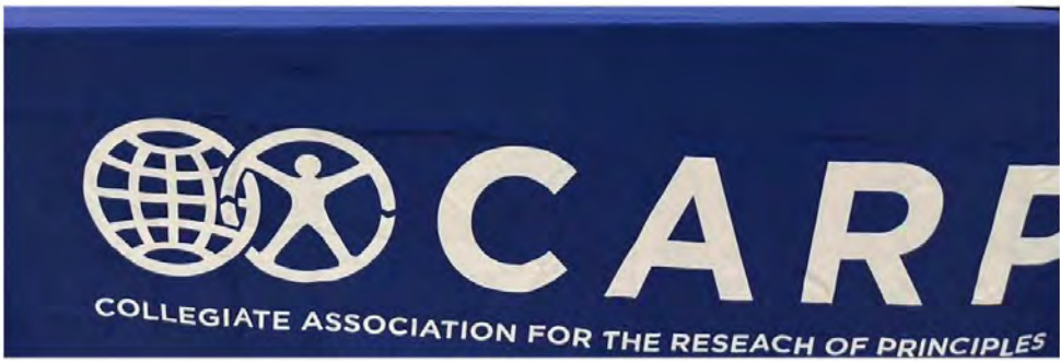
University of Hawai'i at Manoa; Honolulu, HI