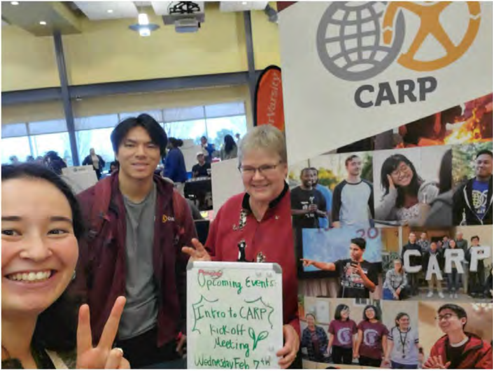
Chabot College; Hayward, CA