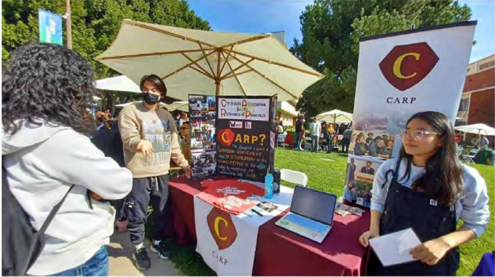
California State University, Los Angeles; Los Angeles, CA