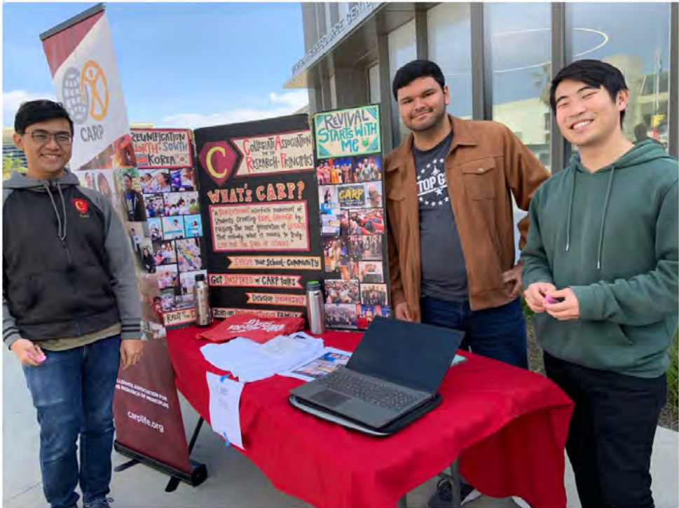
Cypress College; Cypress, CA