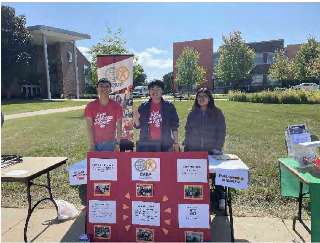
Harper College; Palatine, IL