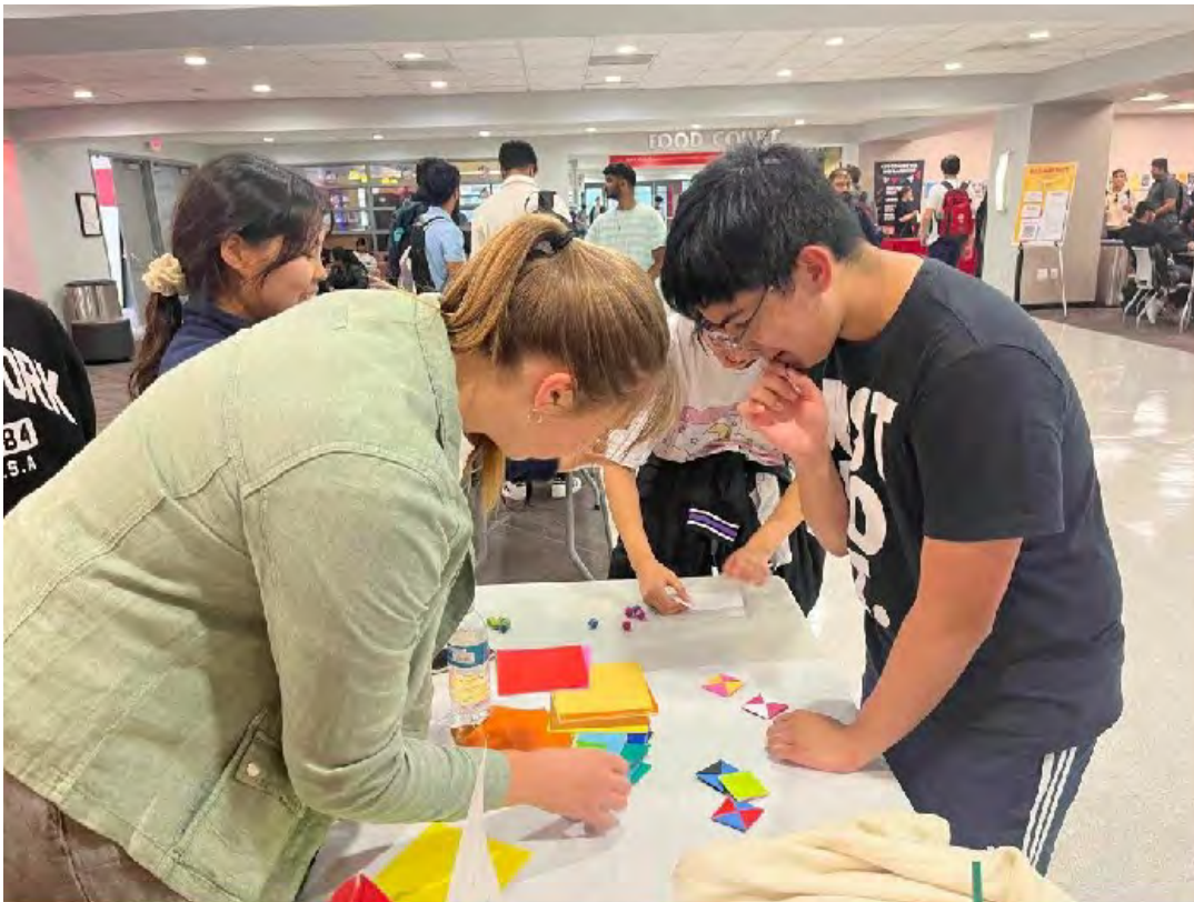
New Jersey Institute of Technology; Newark, NJ

Like they do every semester, many CARP chapters participated in their schools' club fairs, giving them an opportunity to reach out to students and make CARP's presence known on campus. It was very successful, with many students signing up to be part of CARP! Check out the photos: