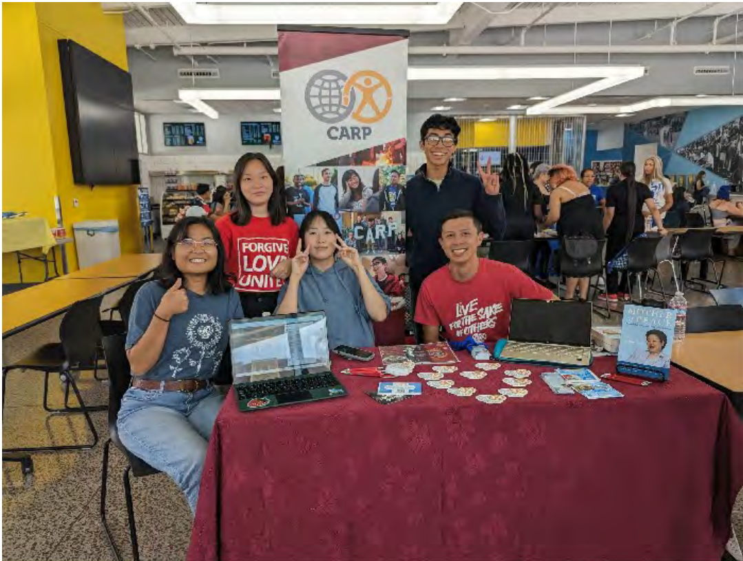
College of Southern Nevada; Las Vegas, NV