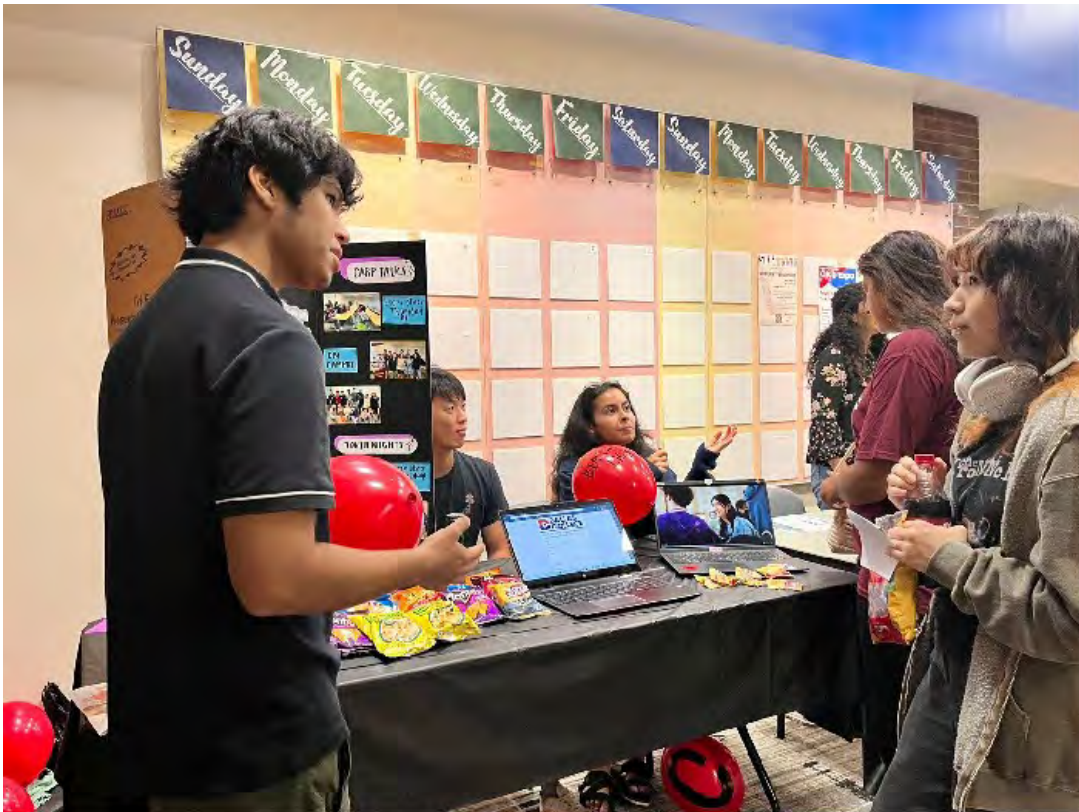
Dallas College, North Lake Campus; Irving, TX