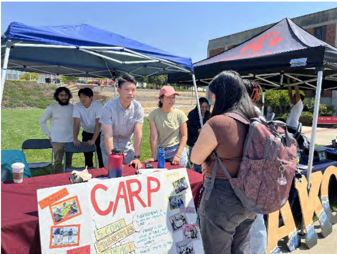
California State University, East Bay; Hayward, CA