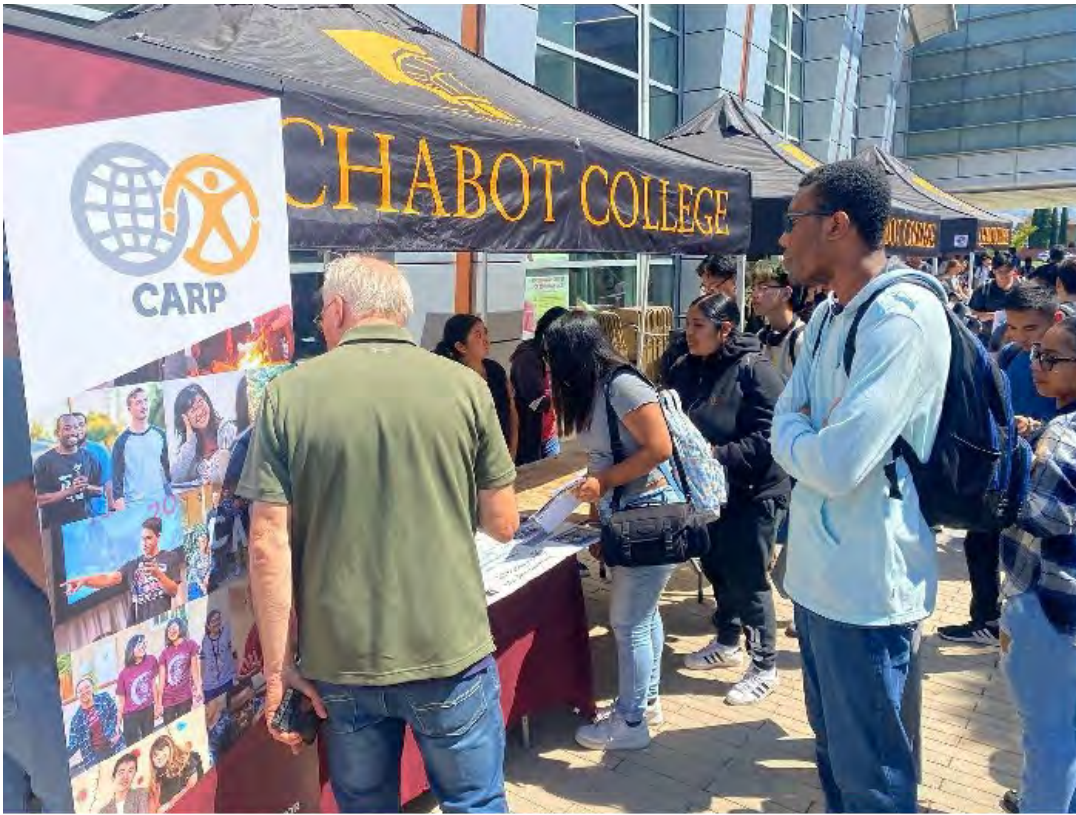
Chabot College; Hayward, CA