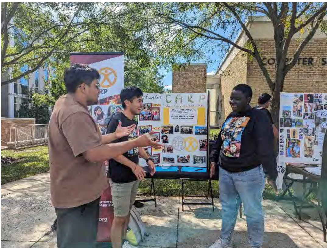
Montgomery College; Rockville, MD