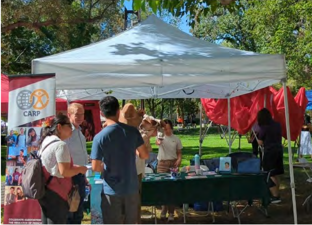
University of Nevada, Las Vegas; Las Vegas, NV