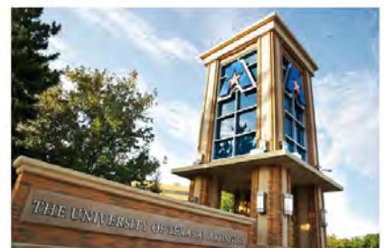
Texas University of Texas, Arlington