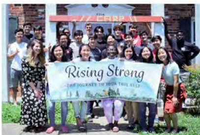
Maryland University of Maryland