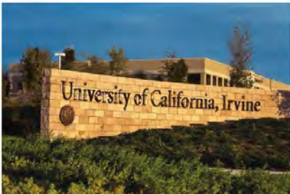
California University of California, Irvine