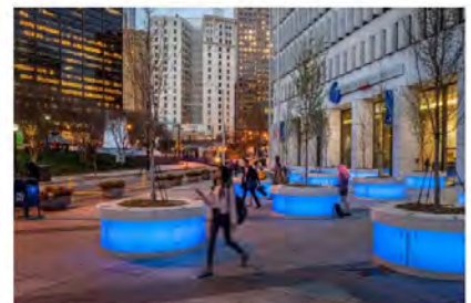
Georgia Georgia State University