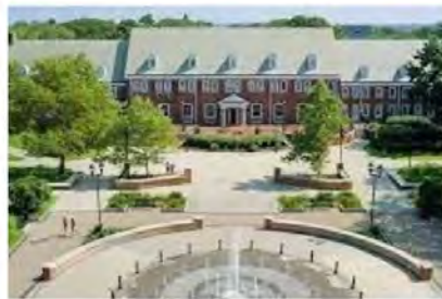
New York Farmingdale State University