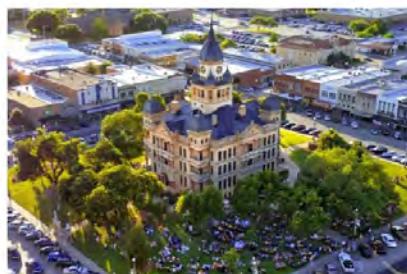
Texas University of North Texas