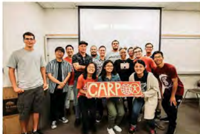
California El Camino College (ECC)