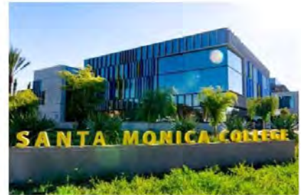
California Santa Monica College