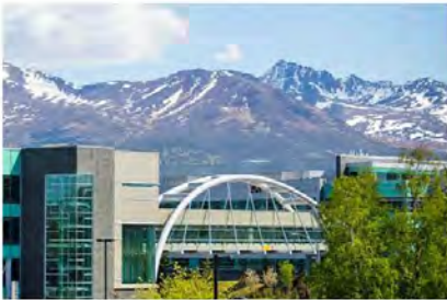
Alaska University of Alaska, Anchorage