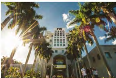
Florida Florida International University