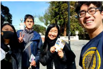
California University of California, Berkeley