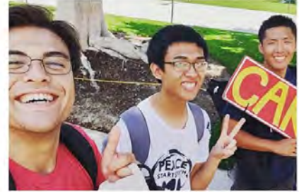
California California State University, Long Beach