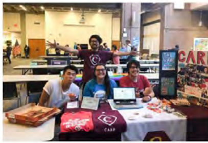
Texas Dallas College, North Lake Campus