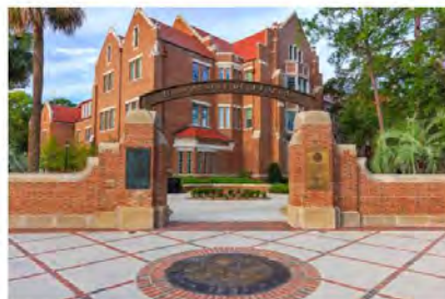
Florida University of Florida