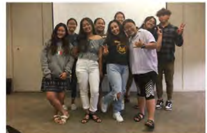
Hawaii University of Hawaii at Manoa