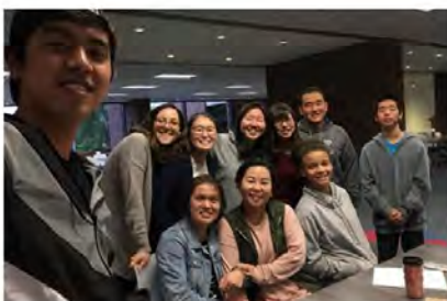
Oklahoma University of Oklahoma