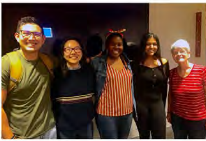
Arizona Arizona State University