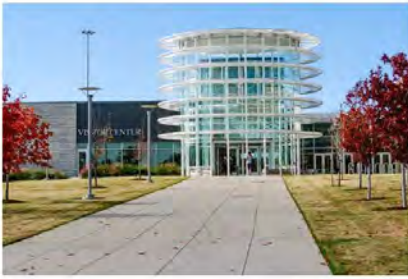
Texas University of Texas, Dallas