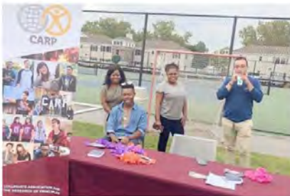
New York Cornell University