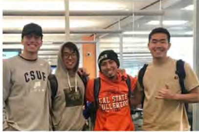
California California State University, Fullerton