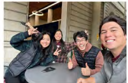
Pennsylvania Community College of Philadelphia