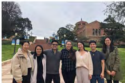
California University of California, Los Angeles