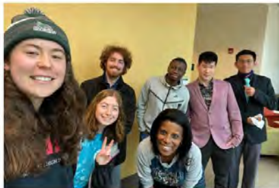
Washington Shoreline Community College