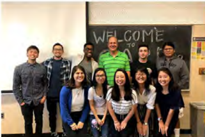
California California State University, Los Angeles