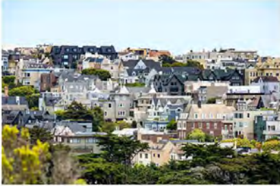
California California State Polytechnic University, Pomona