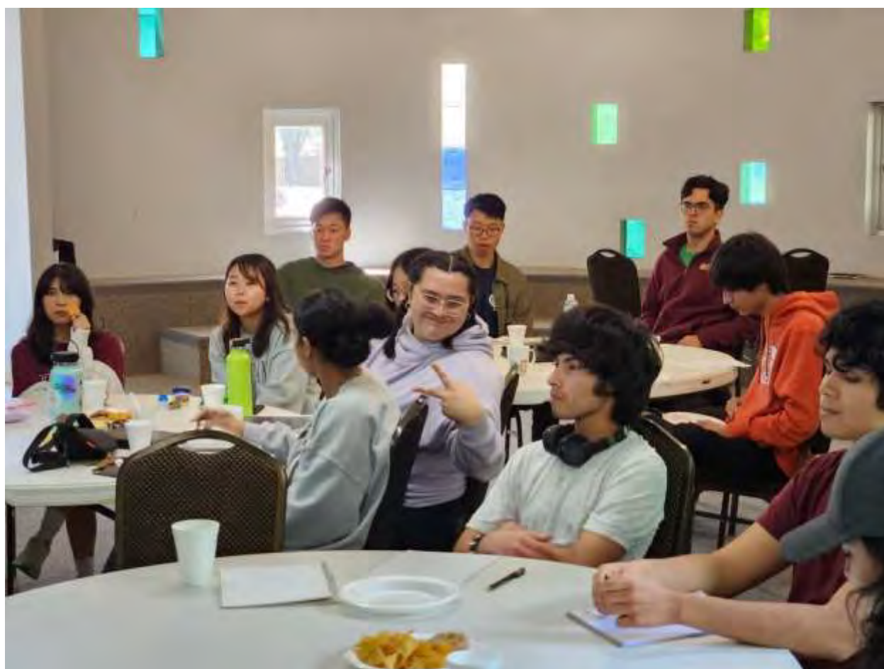
some "foundations of substance" in a sense." - Dallas College student, first time workshop participant