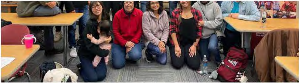
North Lake CARP - "CARP Talk":