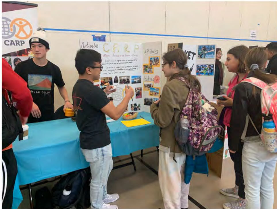
Montgomery College; Rockville, MD

Many CARP chapters around the country kicked off their semester by participating in their school's club fair. By tabling during club fair, CARP leaders are able to introduce their club to their fellow students and get more people involved in CARP activities. They were very successful this year! Check it out: