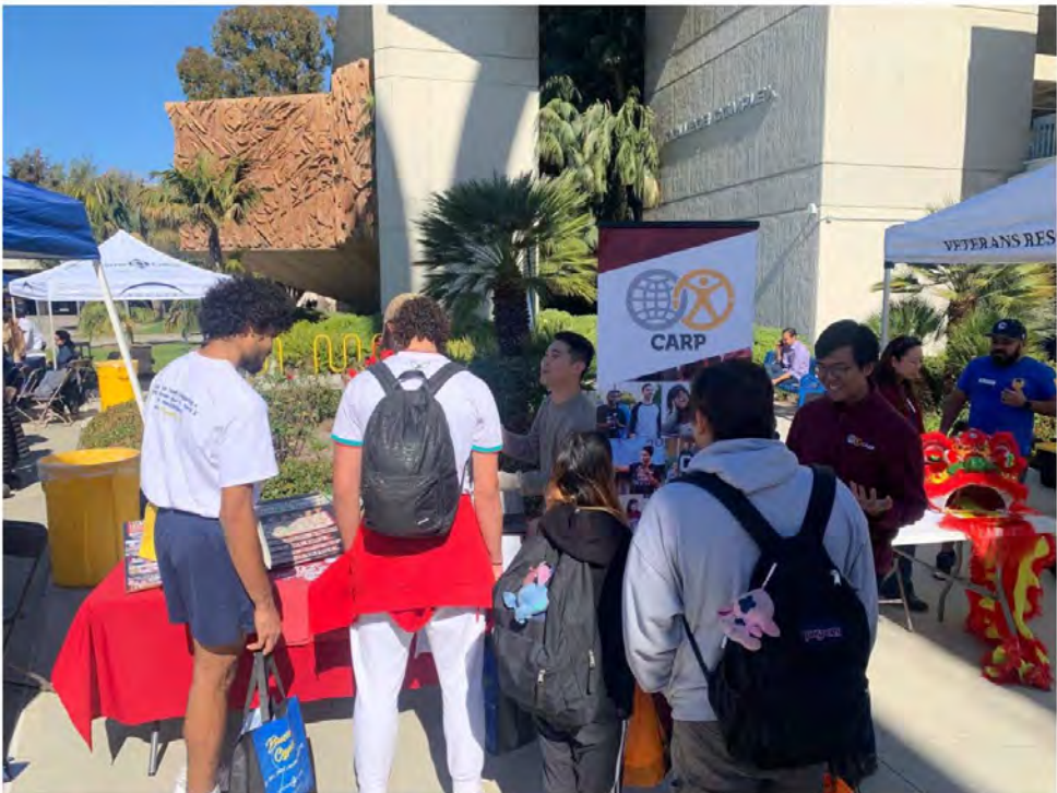
Cypress College; Cypress, CA