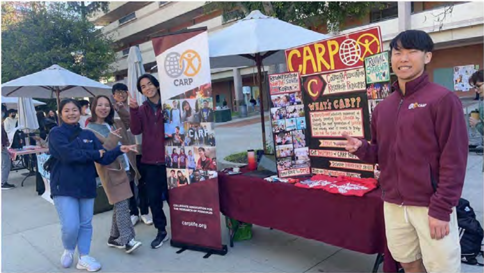
Pasadena City College; Pasadena, CA