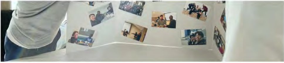
Harper College; Palatine, IL