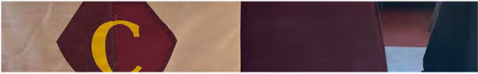
Chabot College; Hayward, CA