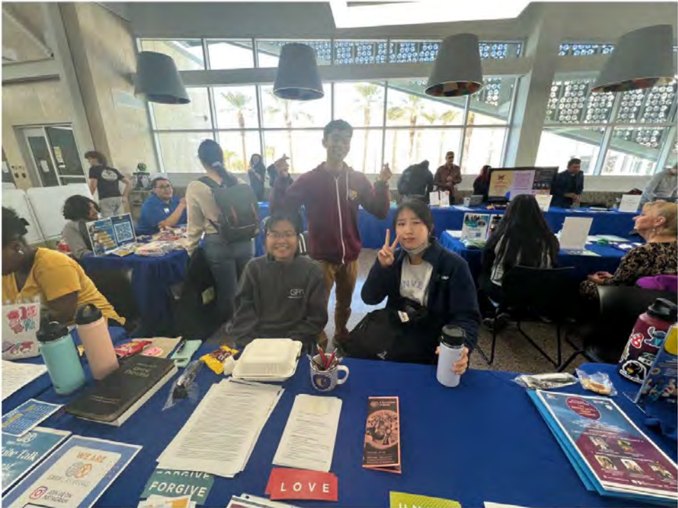
College of Southern Nevada; Las Vegas, NV