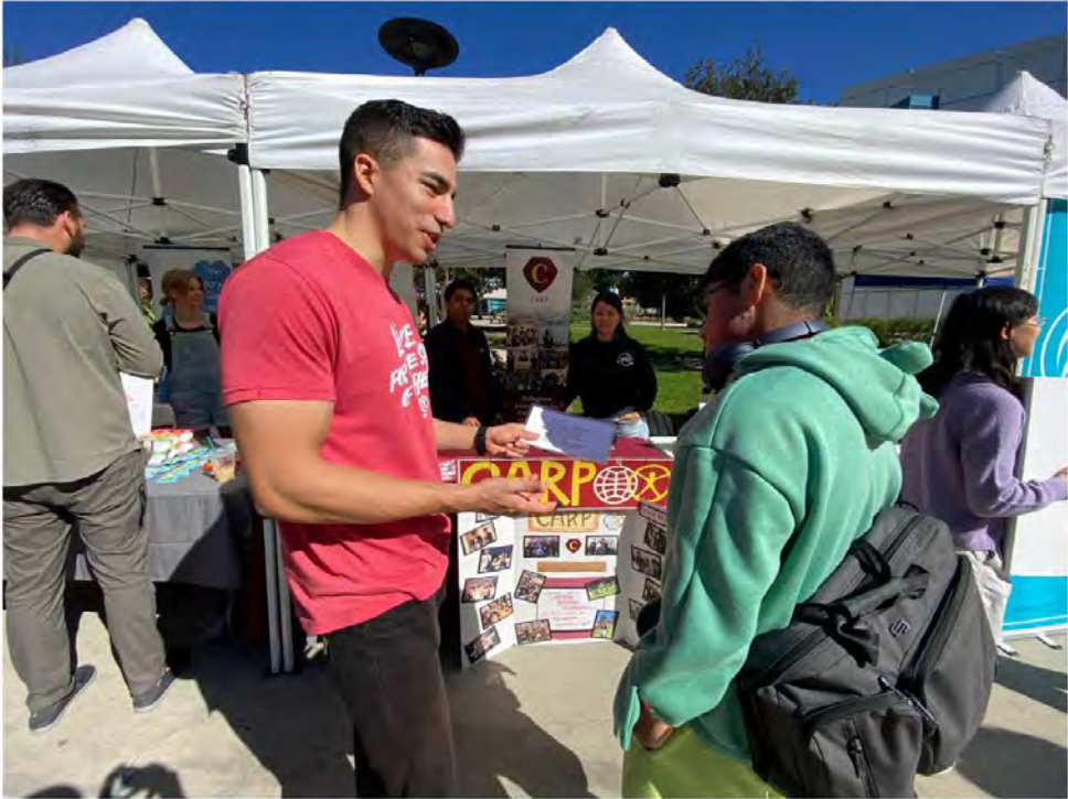
California State University, Fullerton; Fullerton, CA