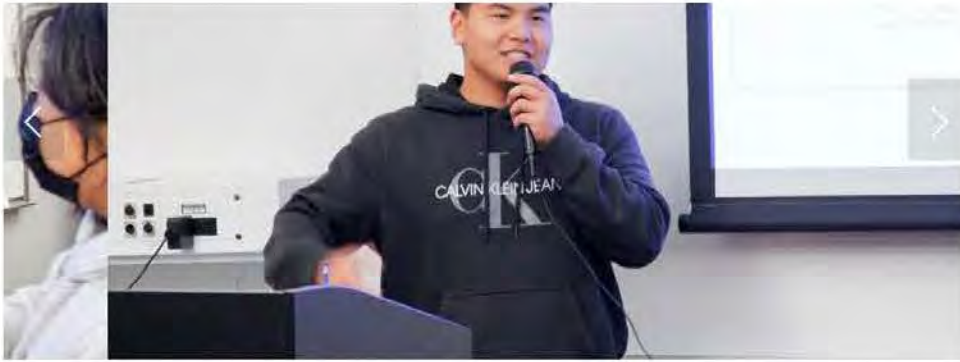
CARP Hawai'i - "Ohana Talk":