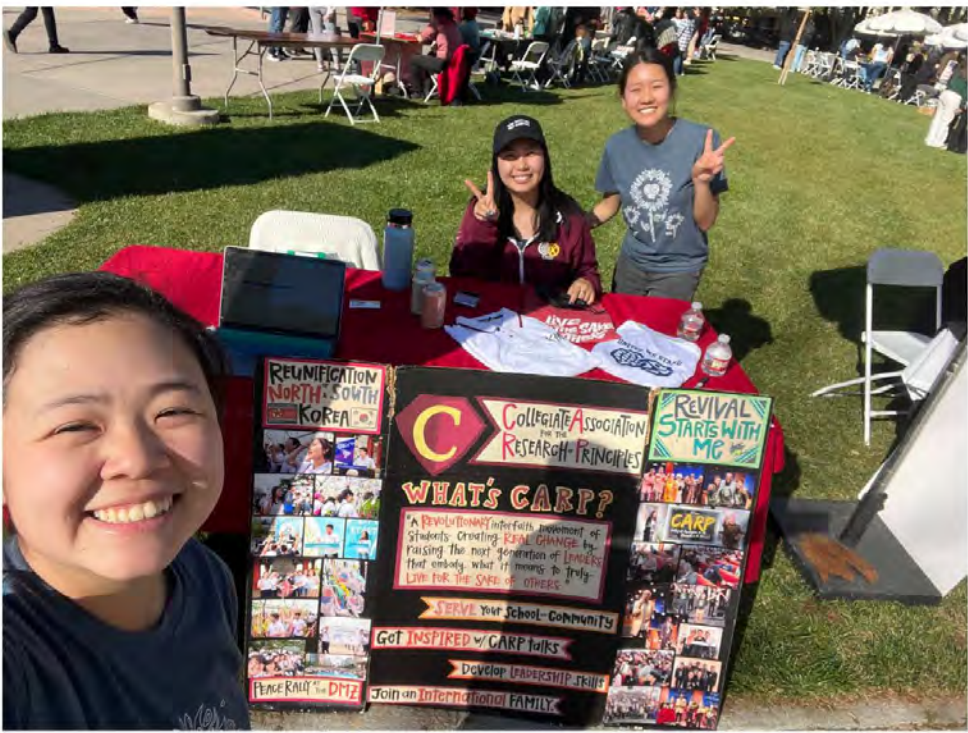
California State University, Los Angeles; Los Angeles, CA