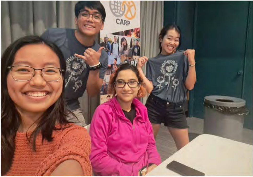
University of Hawai'i at Mānoa; Honolulu, HI