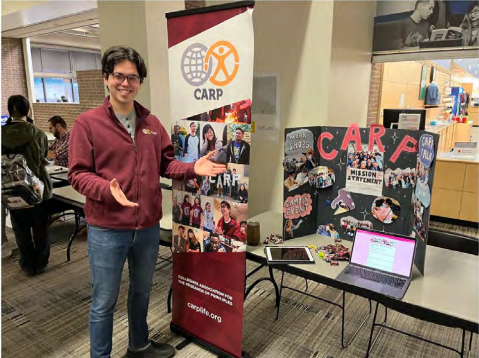
Dallas College, North Lake Campus; Irving, TX