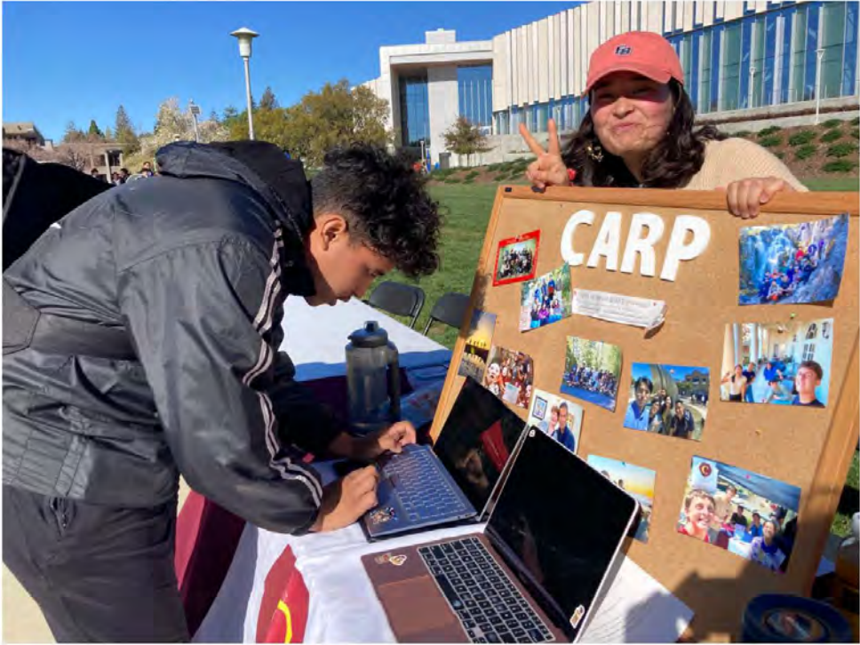
California State University, East Bay; Hayward, CA