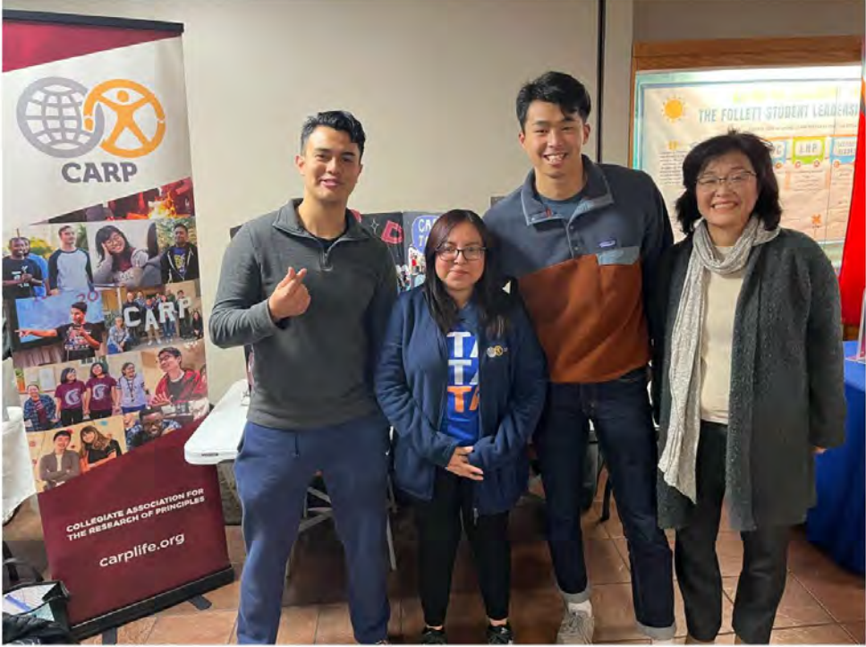
University of Texas, Arlington (UTA); Arlington, TX