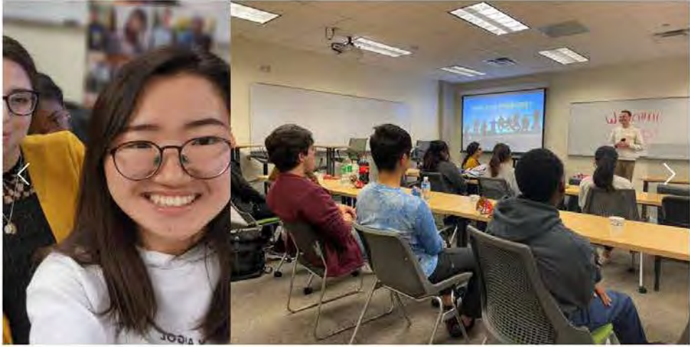
UTA (University of Texas, Arlington) CARP - "CARP Talk":