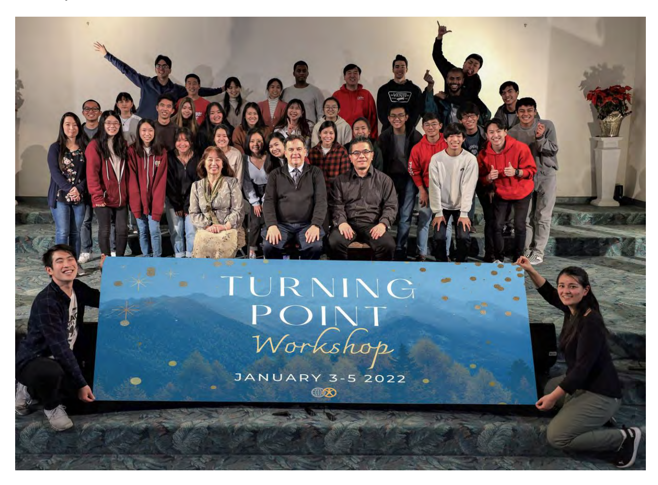
On January 3 to 5, CARP Los Angeles hosted their winter retreat to experience the heart of God by digging deeper into CARP's principles and encouraging students to make it a part of their life. The first two days were hosted online, and the last day was in person. Fifty to sixty students attended the online portion and almost 70 attended in person. Three professors were also able to join the first two days.