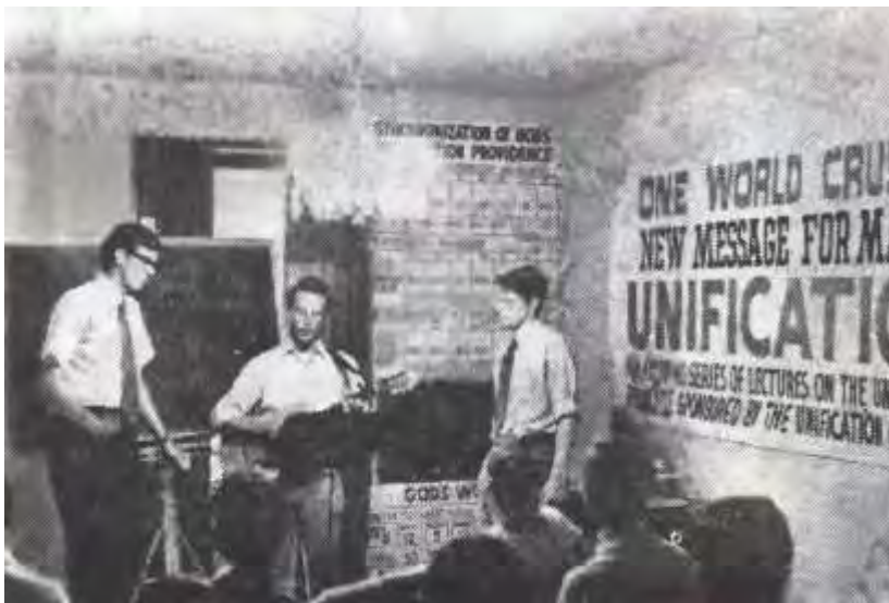
Music presentation at Wilmington Center, Delaware