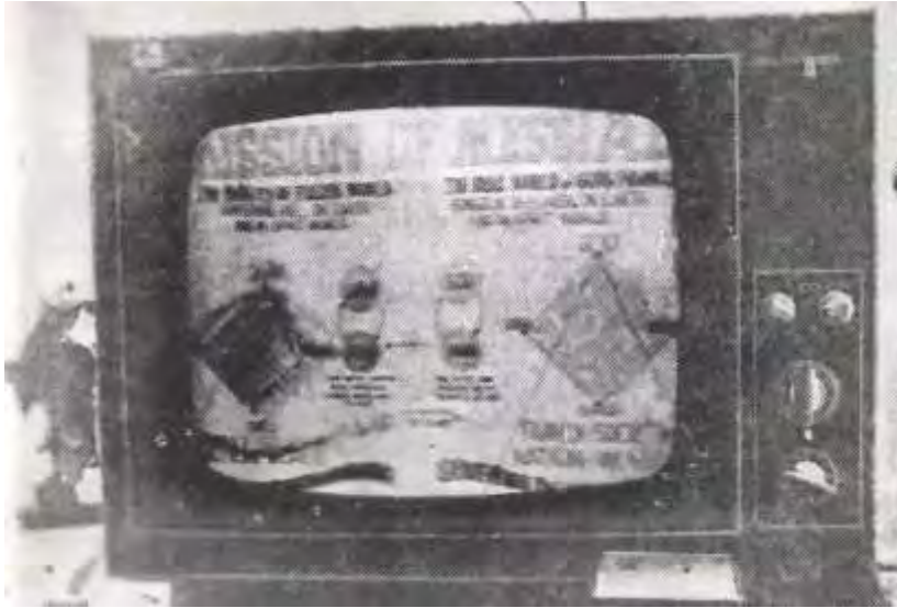
Unification Principle Chart shown on TV