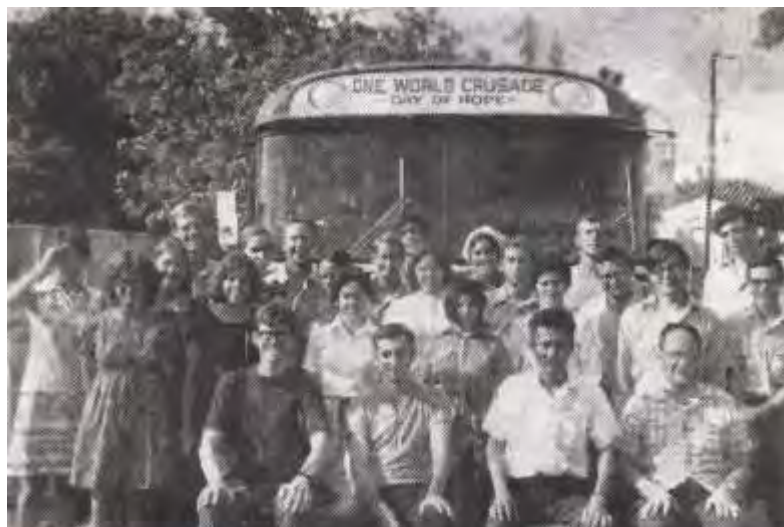
Mobile Unit 2, One World Crusade, landed at Miami, Florida. All pioneers say hello to all family members in the world on June 24, 1972.