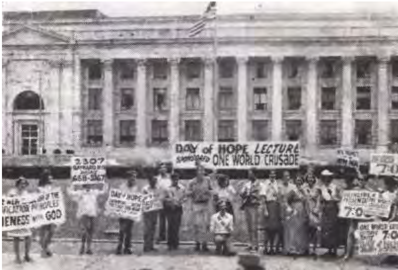
Rally for God at State Capitol of Delaware.

Since we are returning to normal program of seven-day Crusade, weekly family meetings to improve our Unit function and operation have been restored. Also morning prayer meetings will be conducted by small groups, to give all a chance.