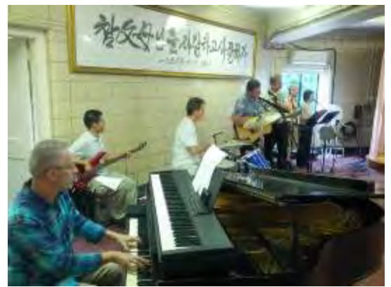
Westrock music team.