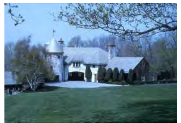
Westrock services are held at beautiful and historic Belvedere.

In this next chapter our community wants to work together, in unity with our True Mother, our National leadership and a new Pastor to lead the way for Heaven.