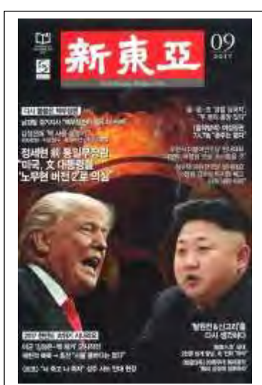
ShindongA – September 2017 Issue (Mainstream Korean Monthly Magazine)

'5th Anniversary of the Seonghwa of Rev. Sun Myung Moon' Family Federation for World Peace and Unification