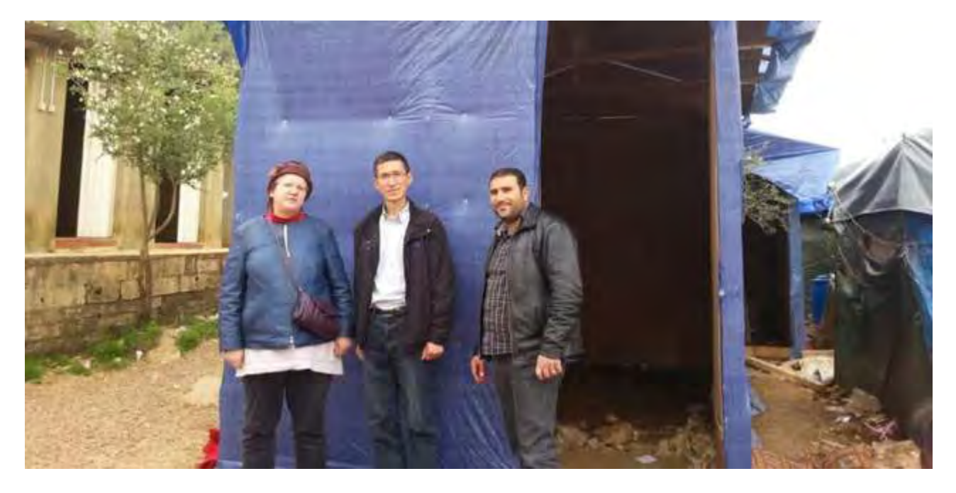
Currently, after completing the construction of the temporary elementary school tents, English and Arabic

These tents will be used as a temporary elementary school, children's play room and library. At the elementary school, thirty-six children over the age of seven and eighteen children under seven will receive education including Arabic, English and mathematics lessons.