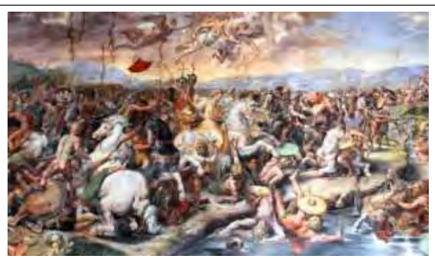
Detail from "The Battle of the Milvian Bridge" (painted 1520–24) by Giulio Romano

civilizations: Western Civilization (Western Europe and the USA), Orthodox Christian (Russia and others), Hindu, Sinic (Confucian China, Korea, and Vietnam), Buddhic (South Asia, Tibet, and Mongolia), and Muslim. The age of the nation-state is over; fasten your seatbelts for a wild clash of civilizations. Without natural borders like the other civilizations, the Muslim world is in conflict with all its neighbors. From the Muslim regions of Thailand, Myanmar, China, and the Philippines in Asia to colonial created half-Muslim and half-Christian states of Africa, and between the Muslim migrants to Europe and the USA, Islam is at war with its neighbors.