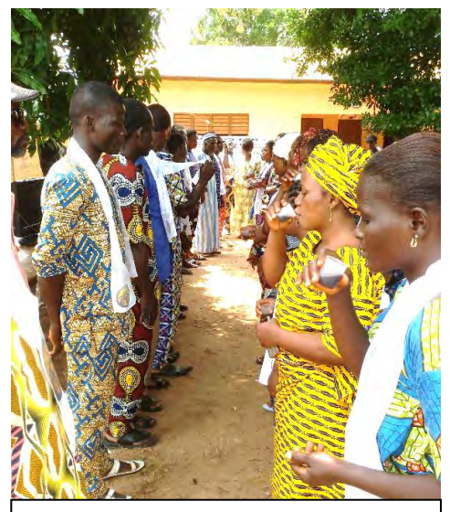
61 couples receive the Holy Wine at the Blessing ceremony.

Despite their many challenges, I have been amazed at the incredible results of the hard work and dedication of the members here; they are in contact with many leaders, including the President of Benin, they hold a vast range and great number of events weekly, and have been giving Blessings and teaching Principle across the entire nation. I really feel that this is a leading nation in bringing about Vision 2020.