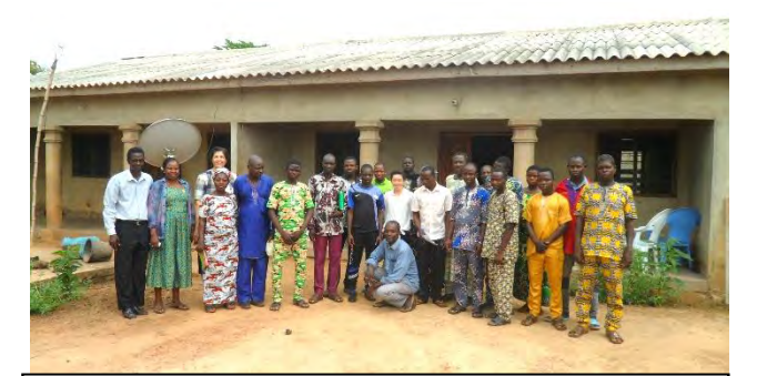
One- day Blessing education seminar for newly blessed couples. Content included Divine Principle lectures and also talks and discussions about how to inherit the tribal messiahship mission and spread the teaching of the Blessing to their local communities