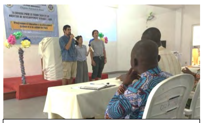
European team perform at the inauguration of the Youth Federation for World Peace event.