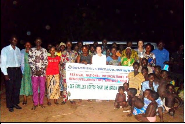
Blessing ceremony held at a Beninese village, where newly blessed couples could celebrate together with their community.

The Tribal Messiahship team has been working extremely hard to bless and educate many couples around Benin. During the past 2 weeks we have attended meetings with 2 mayors, 2 local chiefs and the leader of a peace and family education NGO called Fiffawa, (meaning 'peace' in the local dialect), to discuss giving the Blessing ceremony to the local couples. The leaders have all received us very warmly and have had a very positive response to supporting Blessing activities in their communities.