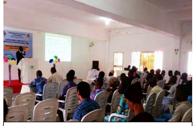
Inauguration ceremony for Youth Federation for World Peace. Students and VIP guests from the government and universities were invited to hear about Vision 2020 for the social and economic development for Benin through strategic goals based on True Parents teachings.

CARP one-day workshop, over 100 new guests attended to hear Principle of Creation and the Human Fall for the first time. CARP-Benin holds this workshop nearly every week.