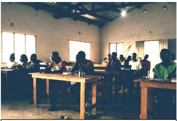
CARP 21-day leadership workshop for first and second generation, 24 participants