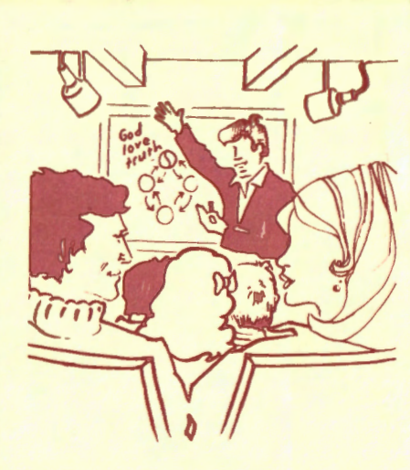
DISCUSSION —informal, revealing dialog

History repeats itself. The chance to save mankind comes every 2,000 years. Now is the time!