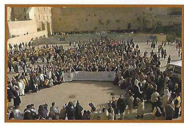
MEPI Participants at the Western Wall in Jerusalem

Person-to-Person Outreach: In brotherhood/ sisterhood ceremonies, people from different faiths and nationalities join hands and cross a bridge of peace together. People team up to knock on doors to listen to people's concerns and provide a living demonstration of diverse people working for a common cause.