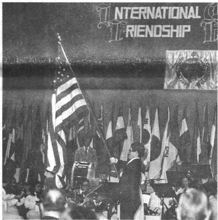
International Flag Ceremony, 1972