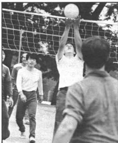
Students enjoy a break from class with lively sports.

both funny and tragic. Recently I went to Massachusetts as you did a few days ago. While I was there I thought of the essential identity of America as a nation in a community of nations. The greatness of America rests on an ideological background. We know that freedom is a vague term, but the people founding America were looking for religious freedom, knowing that the individual by himself is sacred.