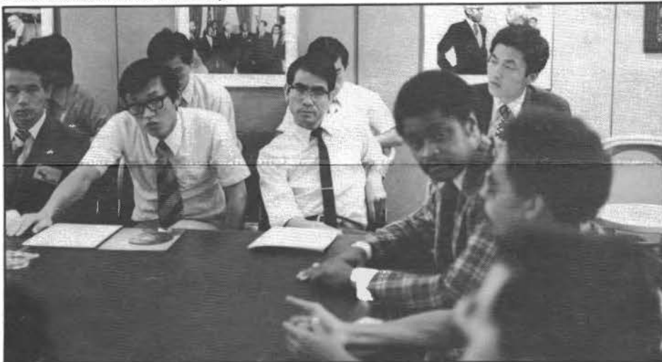
International Leadership Seminar students discussing the international balance of power after a lecture at the training center in Barrytown, New York.