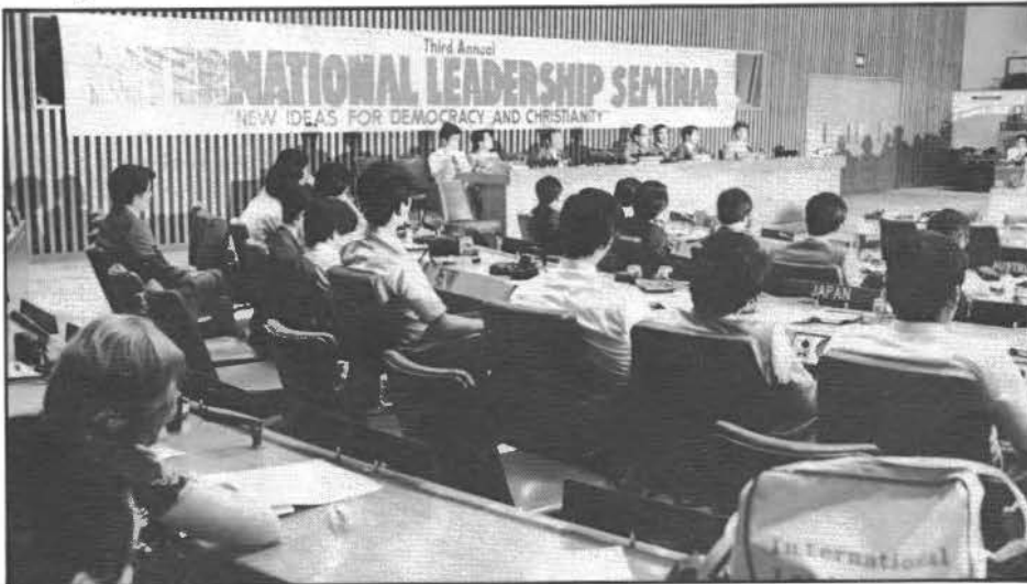
Japanese students hosted by the International Leadership Seminar at a special session at the United Nations in New York City.