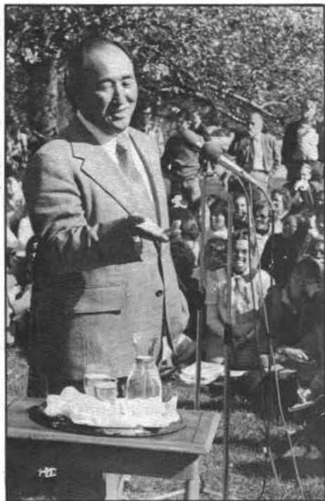
Rev. Sun Myung Moon addressing followers at October 4th picnic.