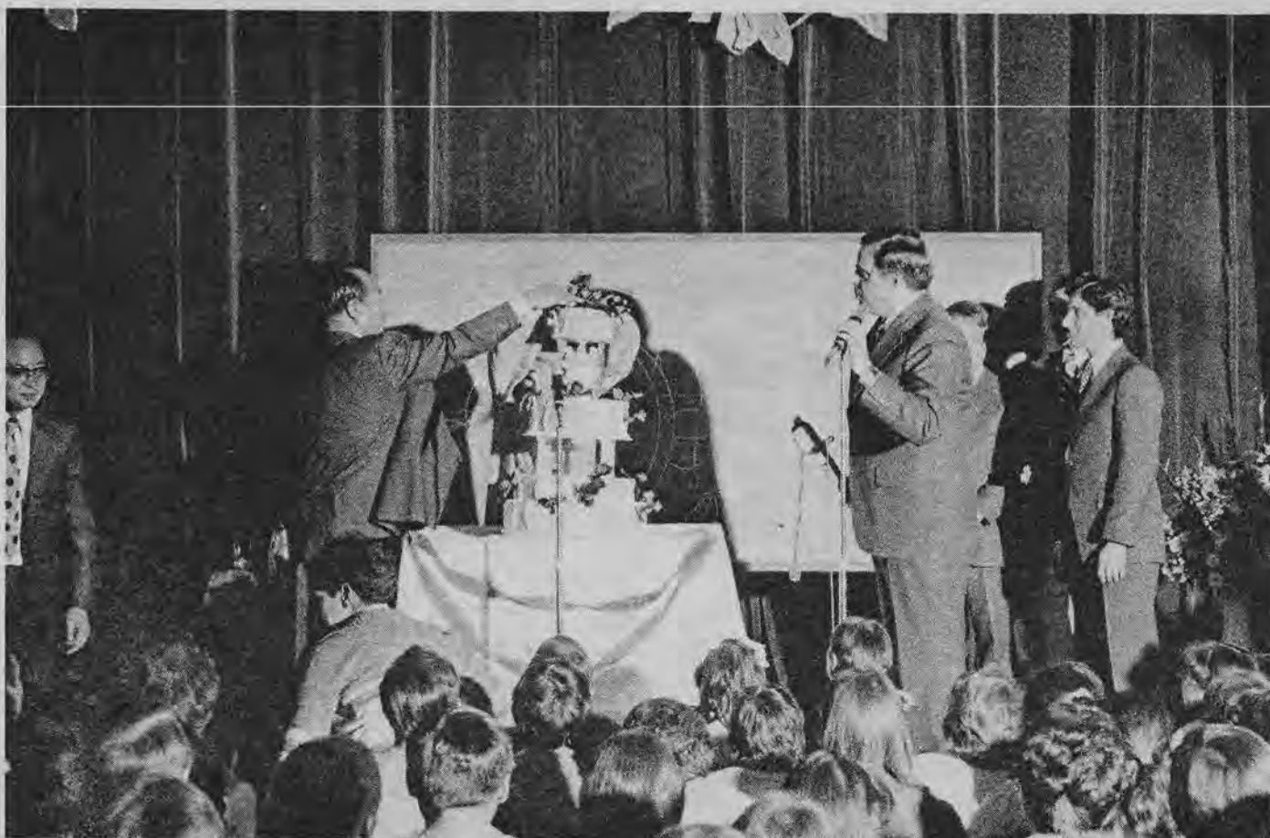
Father and Mother cut the Parents' Day cake.

Father stressed that the external attributes of our mates do not matter; the important thing is that they have the ideology of Godism and a true ideology of love. "The man who attains the true love of God is the man of nobility... Our goal is the ideal family, but it cannot become the ideal if we are arrogant. We must first meet in God and love God more than each other. If you do that, you will become the kings and queens of love... The family is the place where the true love of God is living. The base for the Kingdom of Heaven is the family. The base for the true ideal is the family. The base for true happiness is the family. You must love the family more than anything else. We are setting the conditions step by step to come to the realization of the ideal family on earth, the kingdom of heaven on earth. What is your goal? In your head, a new ideology. In your heart, true love. You will live in the true family. When you come to celebrate this international holiday, the focal point must be the ideal family. If you have determined to fulfill the ideal family, you are entitled to come and celebrate Parents' Day. We are going to ultimately restore Parents' Day and