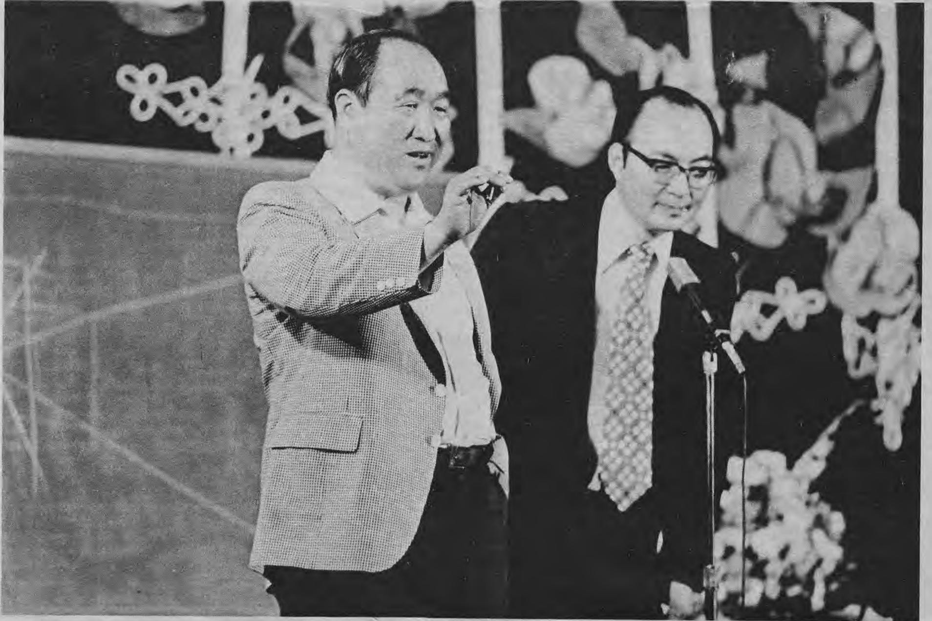
Father speaking to the members on Saturday morning.