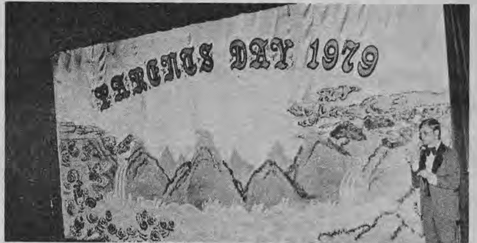
A Korean landscape serves as the entertainment "front-drop"

Parents' Day on a tribal level. If the home church work is successful, he said, our children will not be separated at all from God. If it is not, then our children will have to continue the work. Father concluded: "I would like all of you to be welcomed back to your hometown, and ultimately to live in a happy family. We shall do our utmost with our heart and soul in completion of that goal."