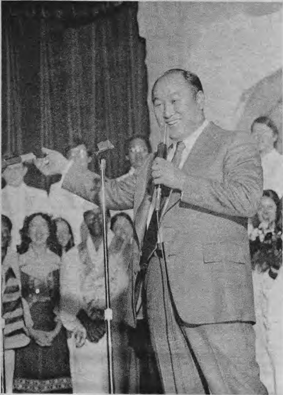
Father and Mother conclude the Parents' Day 1979 celebration in song.