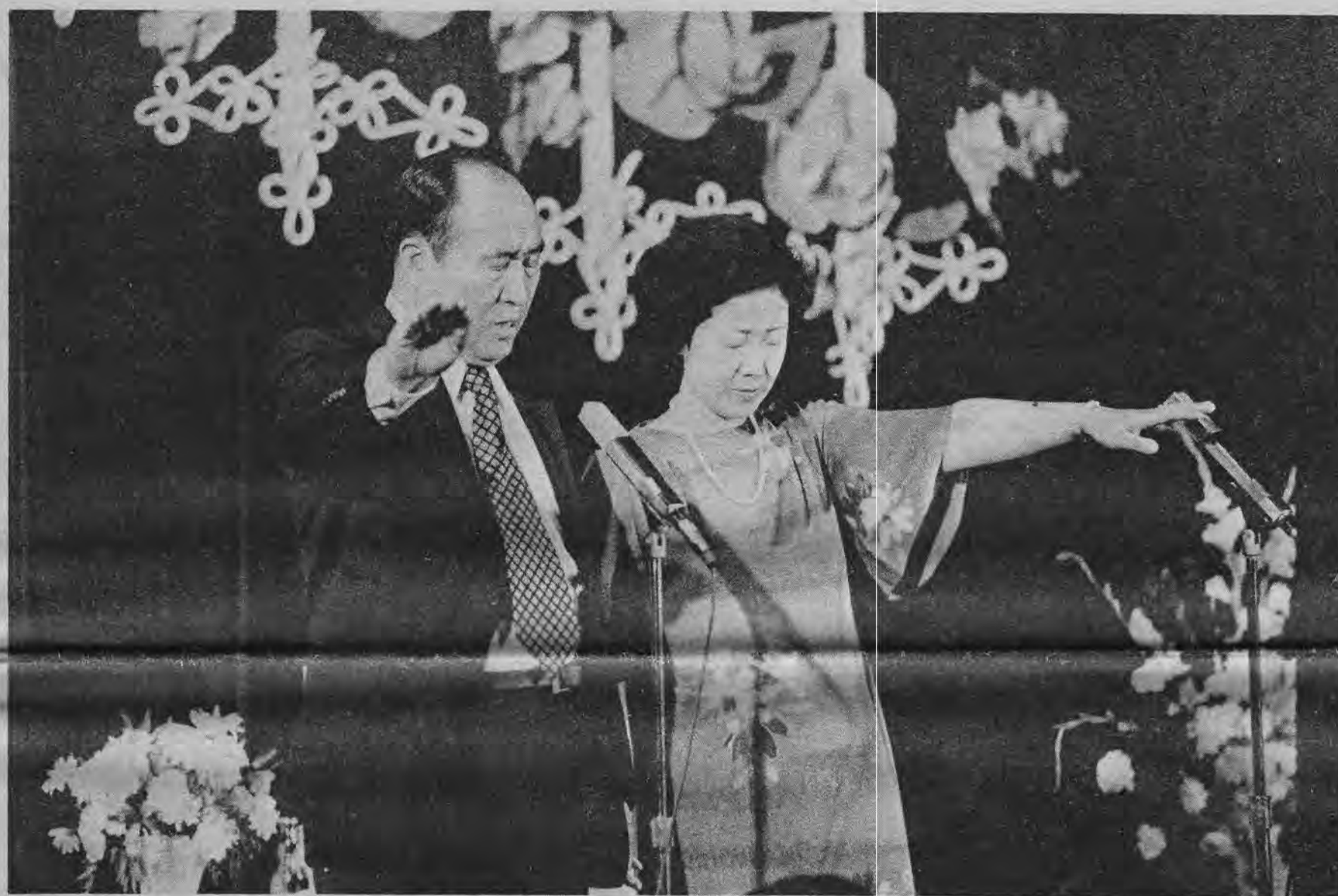
Father and Mother begin the Holy Wine Ceremony on May 13.

May 13th, the day of engagement for 705 Unification Church couples, was the culmination of one of the most exciting events in the history of the Unification Church in America, and was undoubtedly without historical precedent in U.S. history. The couples, gathered in the Grand Ballroom of the World Mission Center, almost as many in number as the 77 couples married nine years previously in Seoul, represented all races and 36 countries. Over fifty of the engagements were between blacks and whites; over 200 were between whites and Orientals, and an additional 100 couples were international. The participants' ages ran from 22 to into the fifties, their missions ran the gamut of possibilities, and length of membership sometimes went as high as ten or more years.