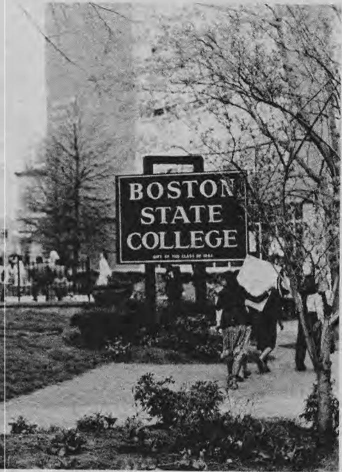
CARP members protesting discrimination at Boston State College.