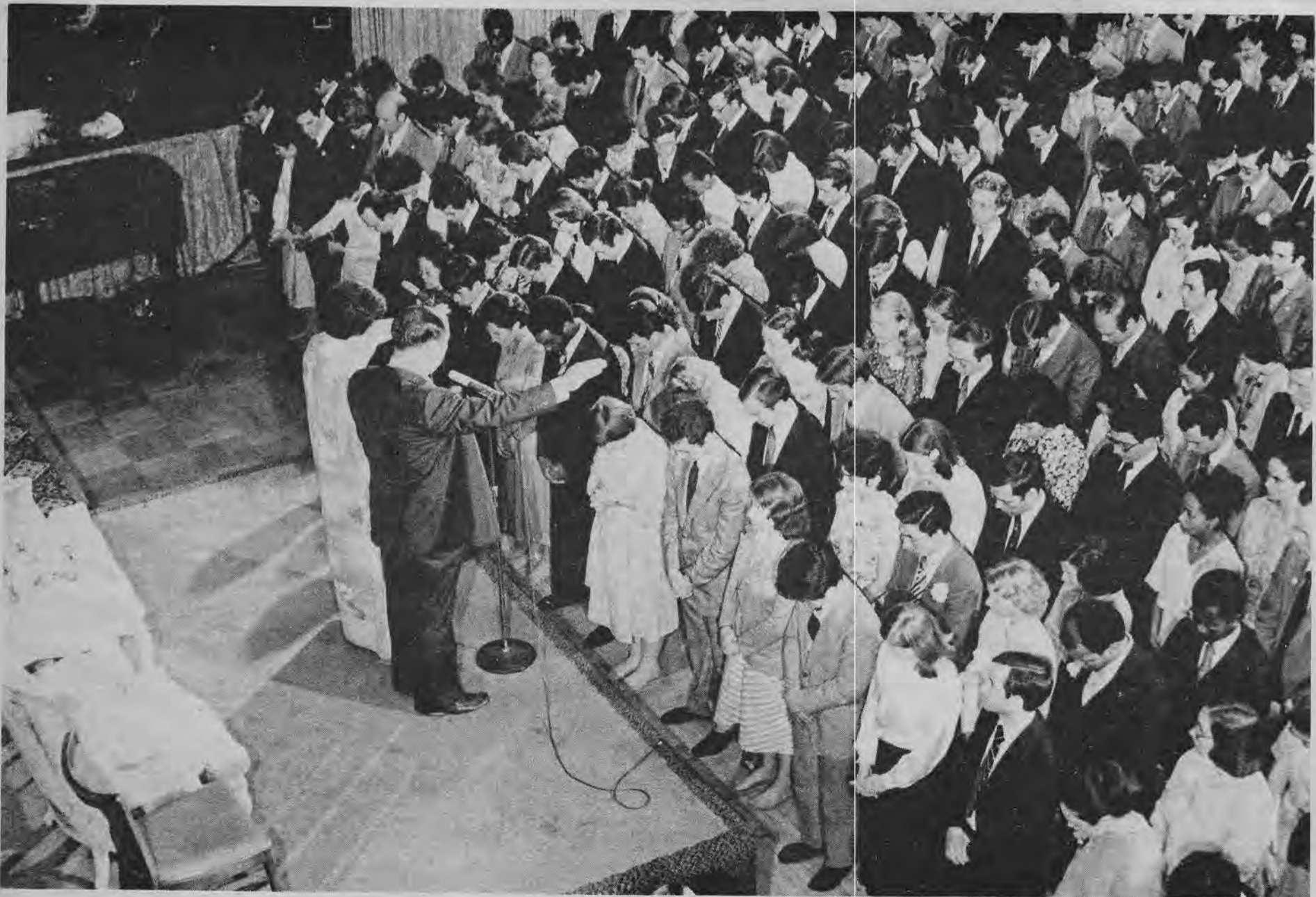
Father and Mother open the Wine Ceremony at 2:40 pm, May 13.

A wedding is perhaps the most important ceremony in life, in which an engaged man and woman stand before God, pledging eternal love as husband and wife, and receiving God's blessing. Because this future wedding will be such a joyful and important moment we will look forward to inviting as many relatives as possible to celebrate this event.