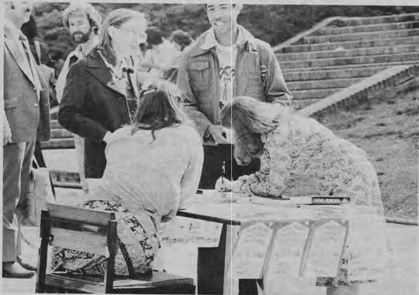
Students congregate at CARP literature table on campus.