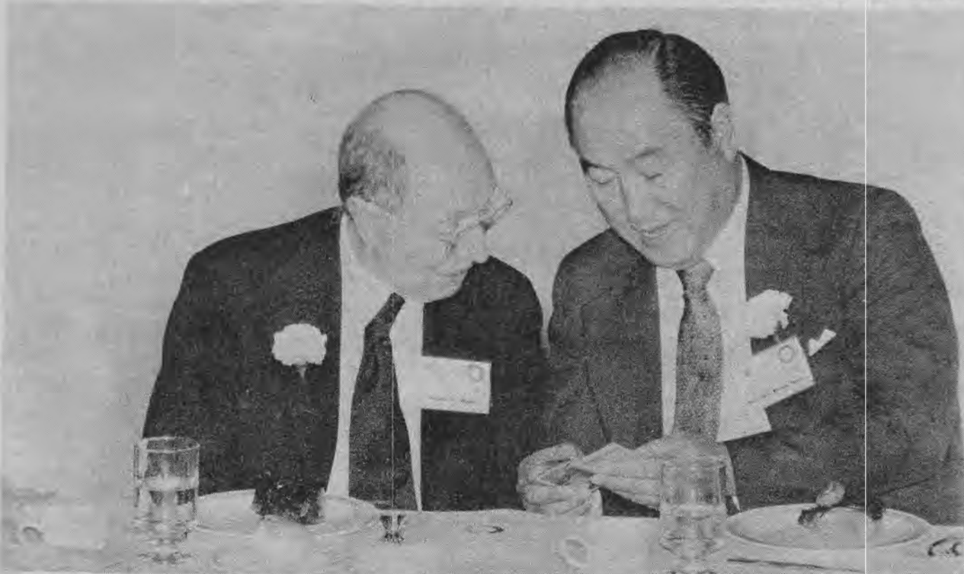
Father shows Professor Eugene P. Wigner some pictures of his family. Professor Wigner won the Nobel Prize for Physics in 1963 and is presently Professor Emeritus of Physics at Princeton University.