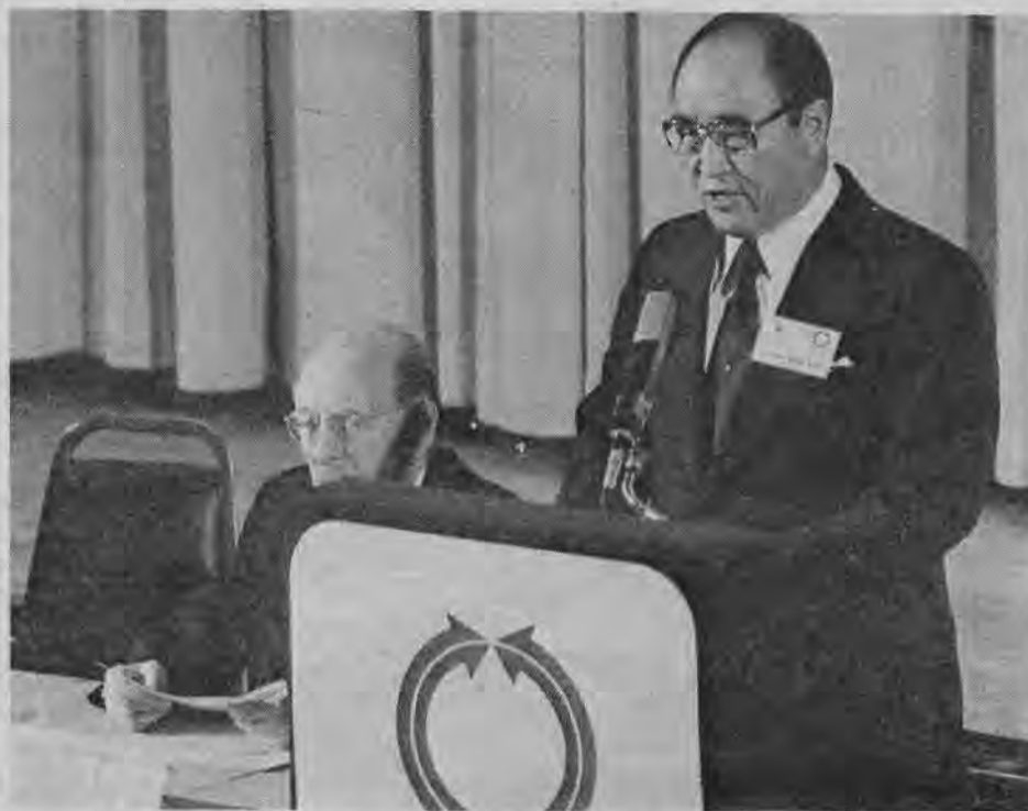
Father addresses the Seventh ICUS Conference. The symbol on the podium represents the dynamics of religious and scientific knowledge, or the subjective and the objective.

Every being embodies dual purpose of existence: both a purpose for individual self maintenance, and a purpose for creation of higher dimension through interaction with other beings. Within each individual being there are subject and object components which interact in harmonious unity. In addition, any being existing in internal harmony also interacts with other beings and thus achieves a being of higher dimension. This occurs when a being takes a position as either subject or object with another being and has give and take with it. As a result, the universe is a hierarchy of beings of increasingly higher and more universal dimensions of direction and purpose. It is composed of subjects and objects interconnected through mutual interest, and it has inherently a common and universal power or force toward the promotion of a