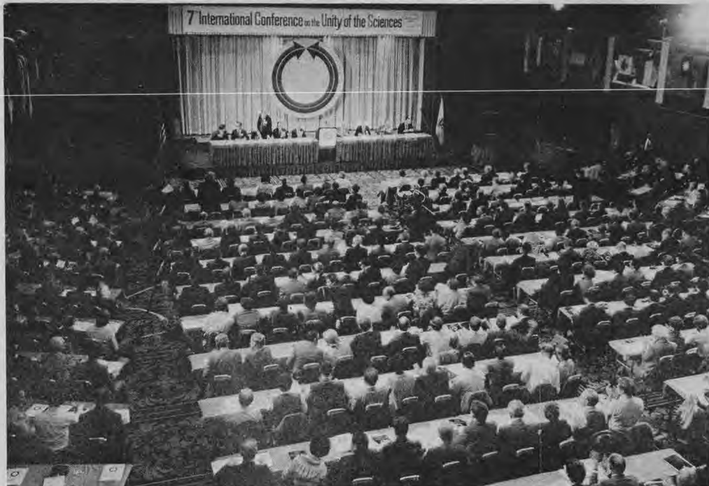
Over 50 scholars and scientists listen to Father's address. They travelled to Boston from over 60 nations in order to attend the Conference.