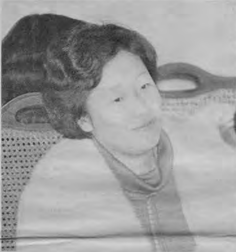
Mother smiles during Father's sermon.