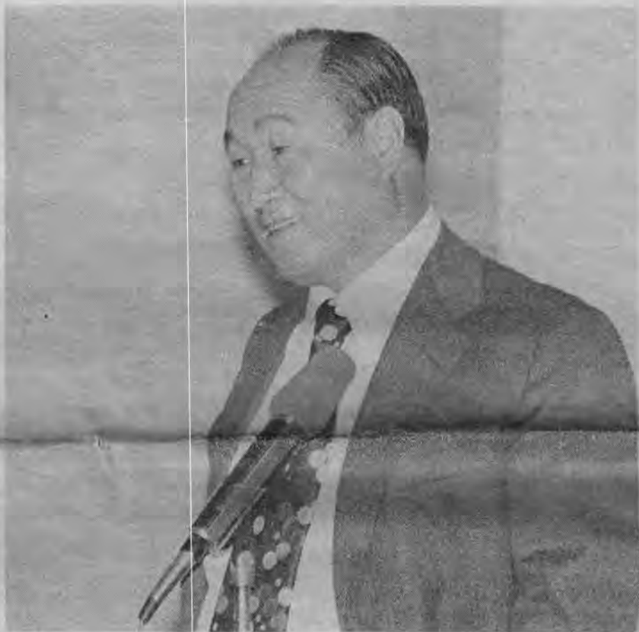
Father speaks at Belvedere.

"Abel was the younger brother. Cain's responsibility was to be obedient to his younger brother. That's why Jesus taught