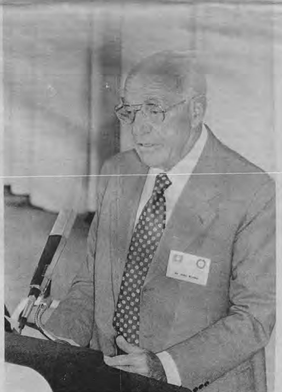
Sir John Eccles, Nobel Laureate in Physiology and Medicine, testifies to the value of Father's founding of ICUS. "I greatly appreciate the deep concern of Reverend Moon about the present and grave predicament of mankind...He has done so much to help young people regain a sense of purpose and direction in life."