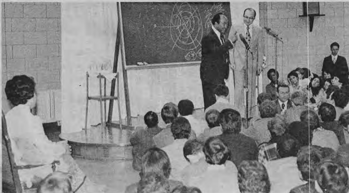
Father explains the diagram on the blackboard: "The individual is circled by a family, tribe, nation and world. The fallen world began with Adam. Therefore, God has followed the same pattern of restoration, starting with the individual and expanding to wider and wider levels."