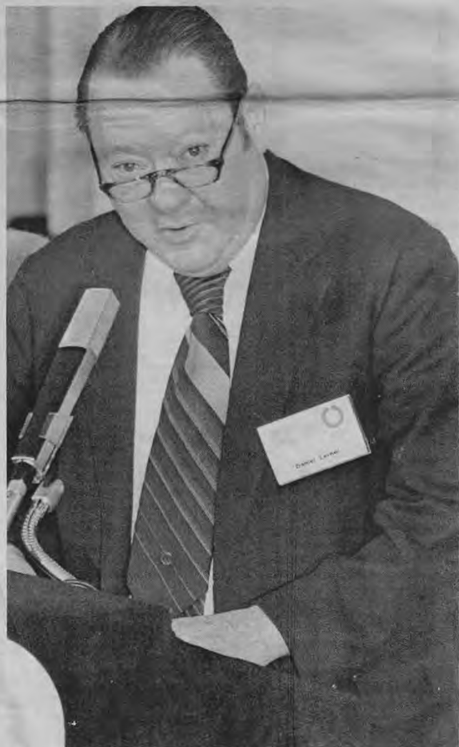
Professor Daniel Lerner, the Ford Professor of Sociology and International Communications at Massachusetts Institute of Technology, headed the Social Sciences Committee.