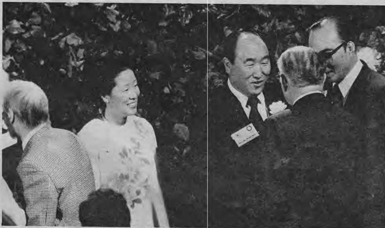
Father and Mother welcome the participants at a reception after dinner.

Participants and their spouses were welcomed at Boston's Hilton Hotel for