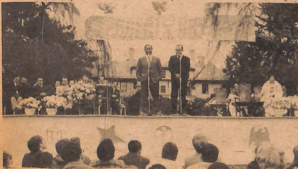
Father giving his Parents' Day morning speech at Belvedere