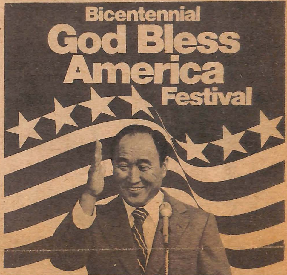
Reverend Sun Myung Moon Principal Speaker