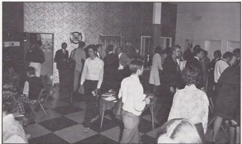
Guests gather in the reception room of the downtown Los Angeles center.