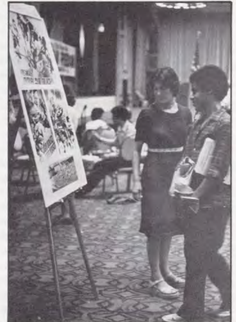
Examining North Korean propaganda posters.

In the interest of all free peoples and free nations, the Freedom Leadership Foundation resolves that the United States must continue to fulfill its commitment to the people of South Korea in order to prevent any North Korean miscalculation that they may use force to invade the South.