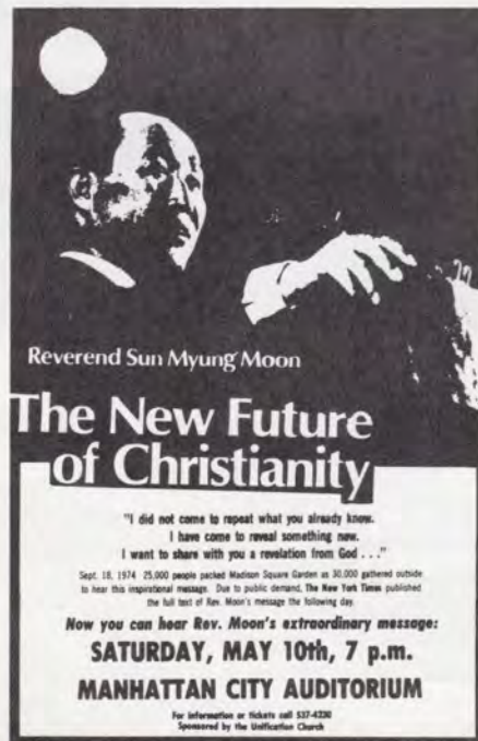
(Above) Kansas members hold rally for Manhattan Day of Hope. (Below) A variety of posters and handbills was used.