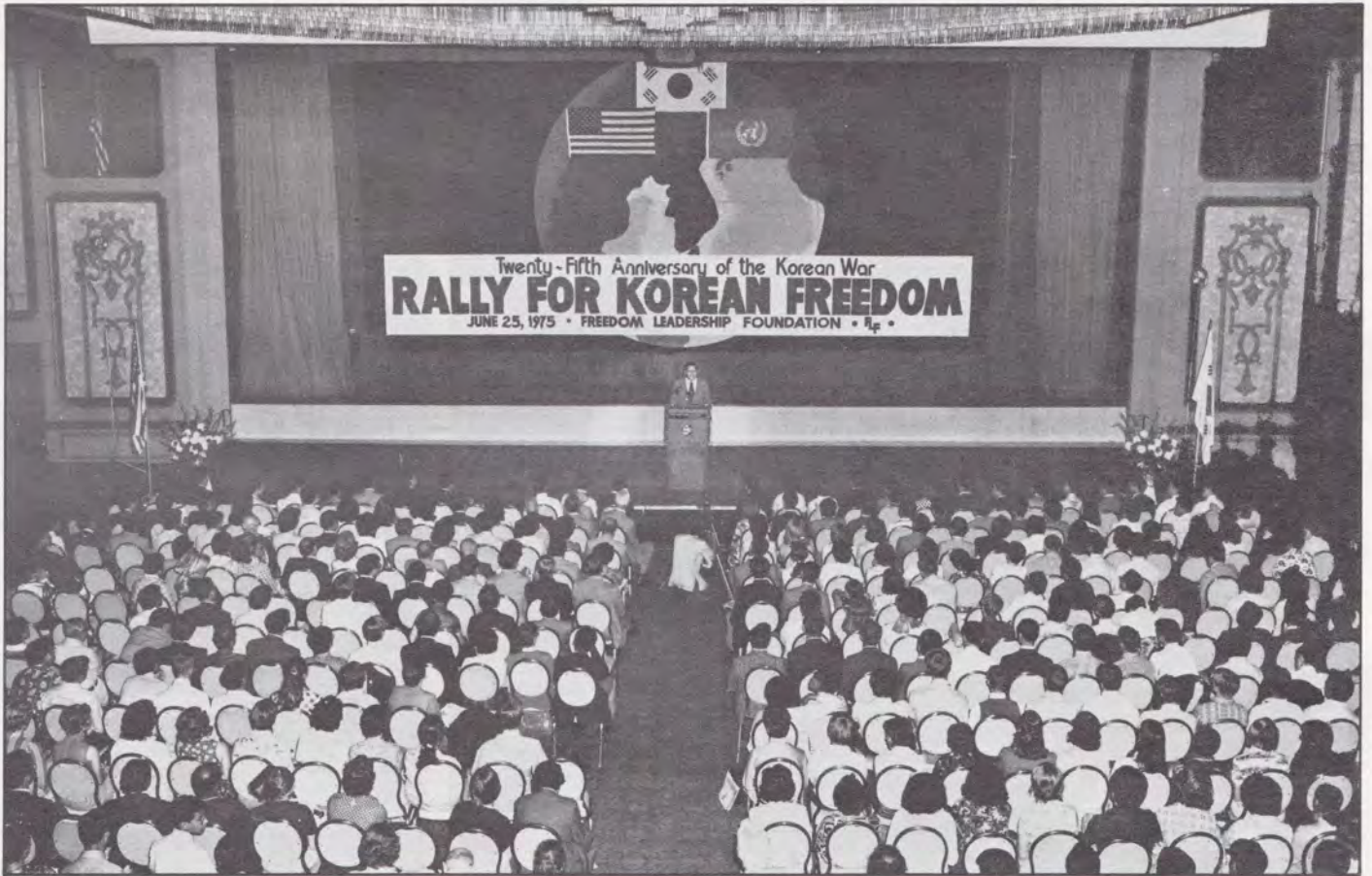
The filled Grand Ballroom was an elegant setting for the commemorative program. The white vinyl banner bore red and blue lettering; the globe design was similar to that used at the June 7th Seoul rally.