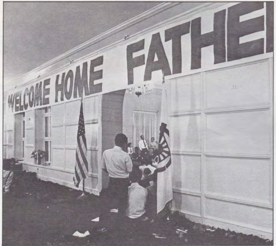
Father speaking to New York and headquarters members in the ballroom of the 43rd St. building on July 2nd. When he finished, he inspected the outside and inside of the building.

On Tuesday, July first, our True Parents returned to the United States, arriving first in Los Angeles and travelling to New York. On the afternoon of July first, Father spoke at Barrytown. Several hundred members, including New York Churches and headquarters staff, gathered at the new 43rd St. building to hear him on the morning of July 2nd. Subsequent speeches were given at Barrytown and Belvedere. His talks have emphasized the importance of the opening of the third seven-year course and preparations for Yankee Stadium. New plans will be reported on in New Hope News as they are finalized.