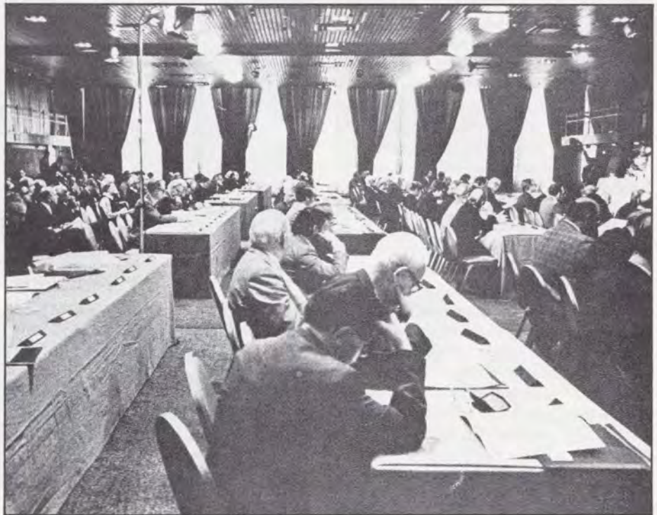
Third International Conference on the Unity of the Sciences, London, 1974.