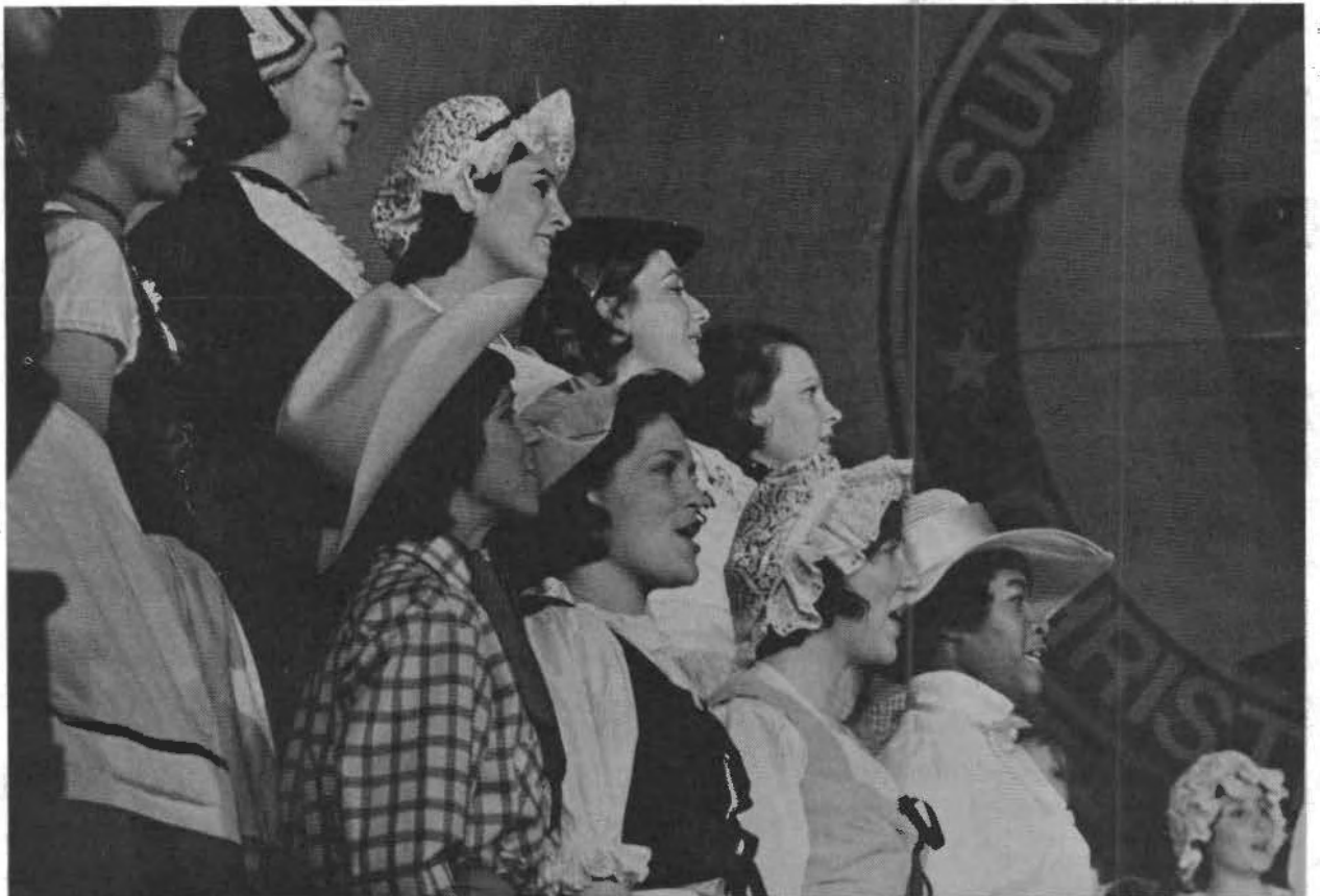
"Songs Around the World"