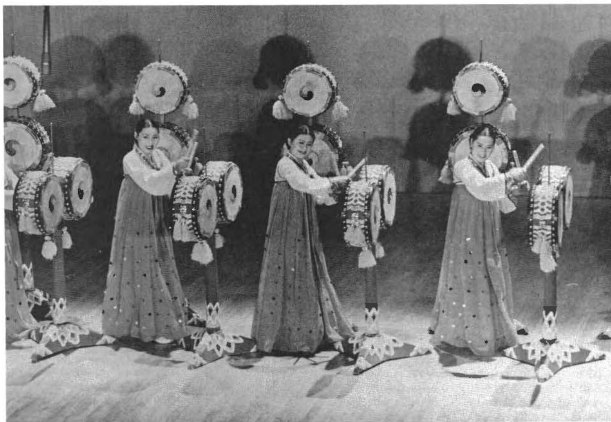
Buk Chum, the Penitent Monk