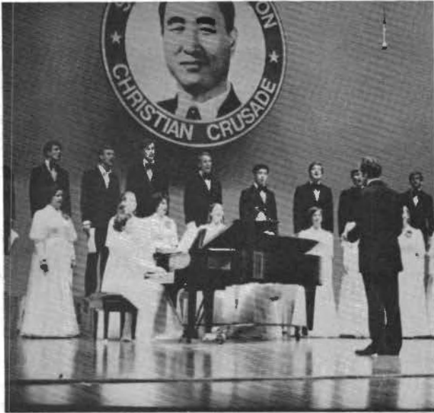
The New Hope Singers International, centerstage group