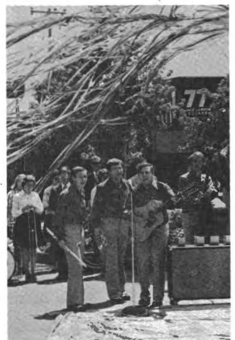
"The Kearney Boys" at Oakland rally.

Bu Chae Chum, the Fan Dance, by the Korean Folk Ballet was next on the program, and was described later by one poetic guest as "hundreds of beautiful butterflies." The dancers open and close their fans, which make a surprising clatter, and weave with them kaleidoscopic patterns through intricate formations and motions. The audience was very appreciative and broke into applause at the appearance of