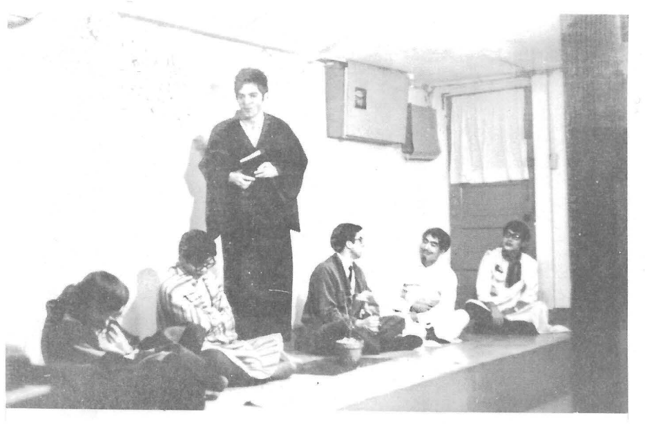
Family Talent show