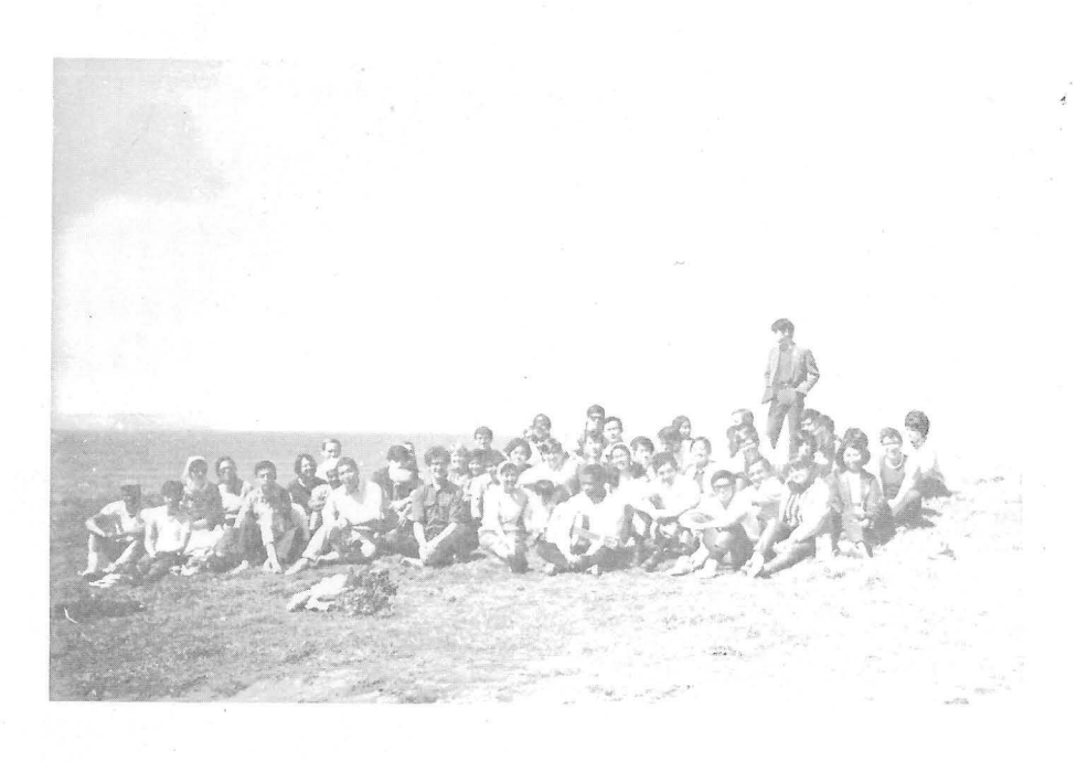
Meeting out field