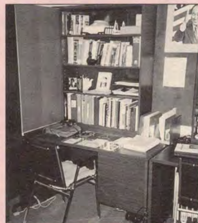
A set of study furniture costs about $500

Please make checks payable to: UTS Alumni Fund