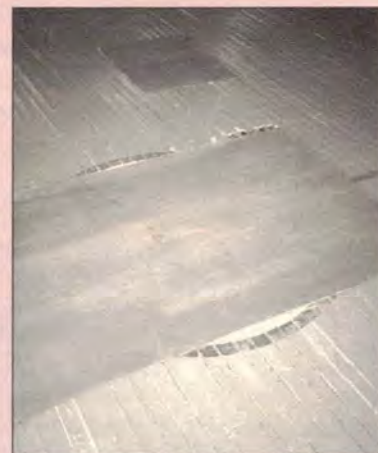
The center of the gymnasium floor