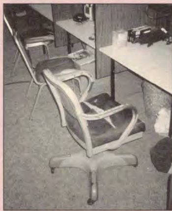
The current state of the study chairs!