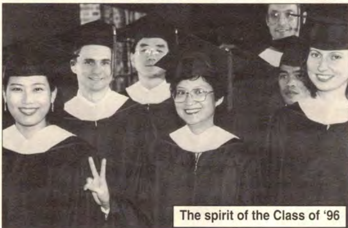
The spirit of the Class of '96