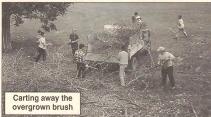
Carting away the overgrown brush

An area which had long lost its original identity as a picnic grove began to appear again on Saturday, April 21 as 15 UTS students participated in a three day clean-up project at Forsyth Park, the oldest of Kingston's recreational areas. Other participants came from the Junior League, the city's Parks and Recreation Department, the Ulster County Alternative Sentencing Program and the Kingston branch of the NAACP.