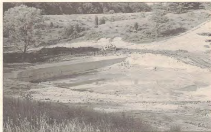
A view of the "pond" in 1978 showing the dam in construction

T hose who dig the pond (especially those who dug the pond) will be happy to know that it is a thriving wildlife sanctuary. Those big carp which were rescued from the Hudson's poisoned waters are now much bigger and are surrounded by several generations of teeming offspring. They have been joined by perch, bluegill, largemouth bass, eels, catfish, bullfrogs, musk rats