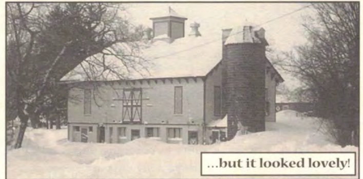
...but it looked lovely!