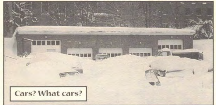
Cars? What cars?