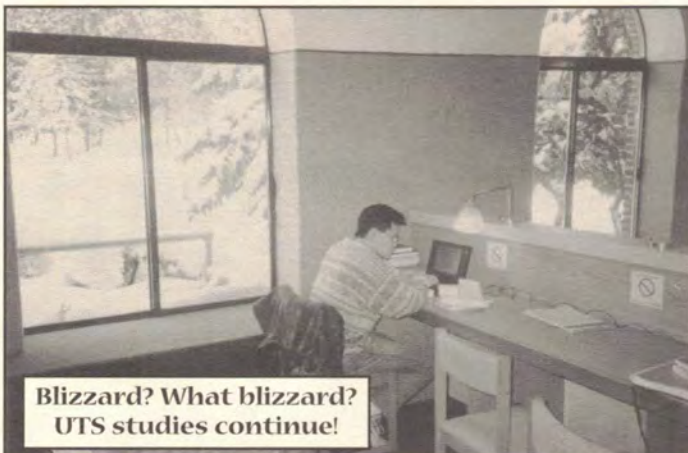
Blizzard? What blizzard? UTS studies continue!

The Cornerstone is published monthly by the UTS Development Office.