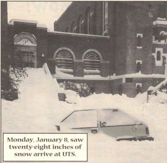
Monday, January 8, saw twenty-eight inches of snow arrive at UTS.