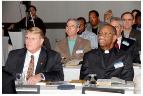
ACLC Convocation participants attending TFV lectures with workbook and the Holy Bible.