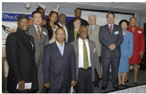
ACLC National Executive members and other leaders (ACLC 3-Day National Convocation at Ocean City on October 10-12, 2007)