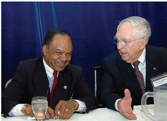
Former US Congressman Rev. Walter Fauntroy and Former head of the US mission to Iraq, Ambassador Edward Peck, have a discussion