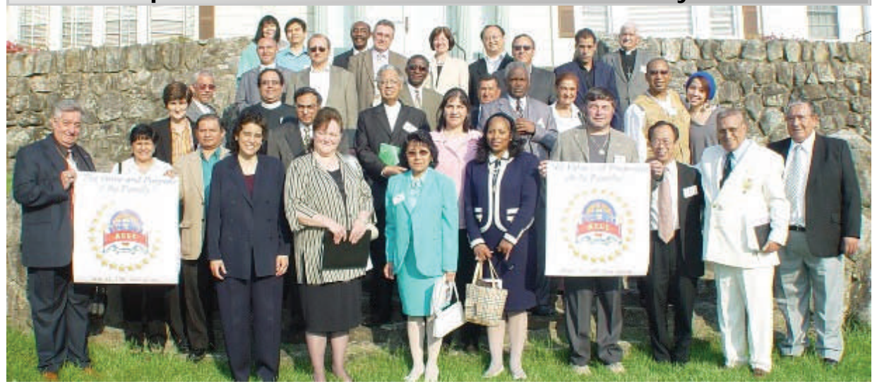
All participants of the ACLC National Hispanic Clergy Conference at Carmel Retreat Center in Mahwah, NJ.

he conference setting of the first Spanish-American ACLC conference was beautiful: