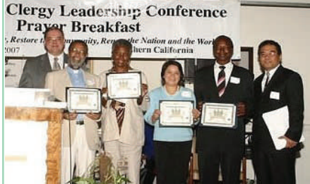
New ACLC members received certification

It was a prayer breakfast in which we could truly feel both the masculine and feminine aspects of God. The April 28th ACLC monthly prayer breakfast in Los Angeles took place in the Christian Light Missionary Baptist Church. More than 100 participants were present in the ACLC program.