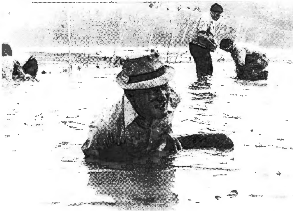
Catching carp in the Hudson River Lagoon

the Unification Church and in other Unification-related activities. Furthermore, more than 40 of the early UTS graduates were selected to continue their graduate study at some of America's most prestigious colleges and universities including Harvard, Yale, Princeton, Columbia, Chicago, and Vanderbilt. Out of the original 40 UTS graduates selected for doctoral study (and provided with full scholarships to continue their graduate study) at least 36 of them have successfully completed their doctoral studies.