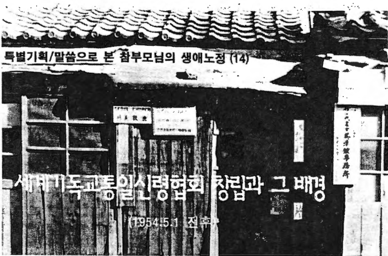
House of Three Small Doors, 1954

written in Chinese letters, and two of them I do not even remember now, probably because they were not relevant to our movement. But the third name was the one that we all agreed upon, that which we now use for identifying our work—"Holy Spirit Association for the Unification of World Christianity" (HSA-UWC, or Unification Church). I translated our final choice into English for a small sign board on which were written both Chinese and English letters. I had a little difficulty in translation it, because Holy Spirit implies one of the Trinity as taught in orthodox Christianity, but in Korea it means holy, or spiritual association ( Shil-Ryung ). I could find no other way to translate the original Chinese letters.