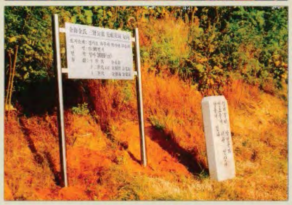
Entrance sign to cemetery with three generations of Kim ancestors