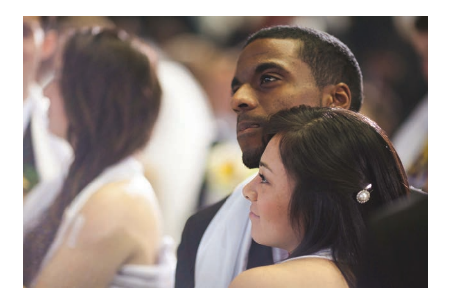
The family is God's first and only institution. The family is infinitely precious because it is a little world created by love.