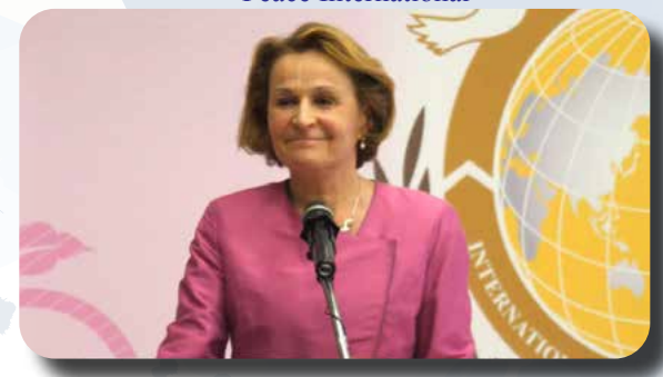
H. E. Anneli Tuulikki Jaatteenmaki Former Prime Minister of the Republic of Finland