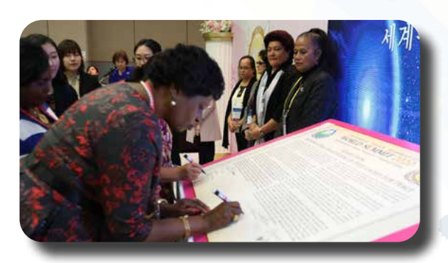
Former First Lady Callista Jennie Mutharika signs the Resolution of IAFLP