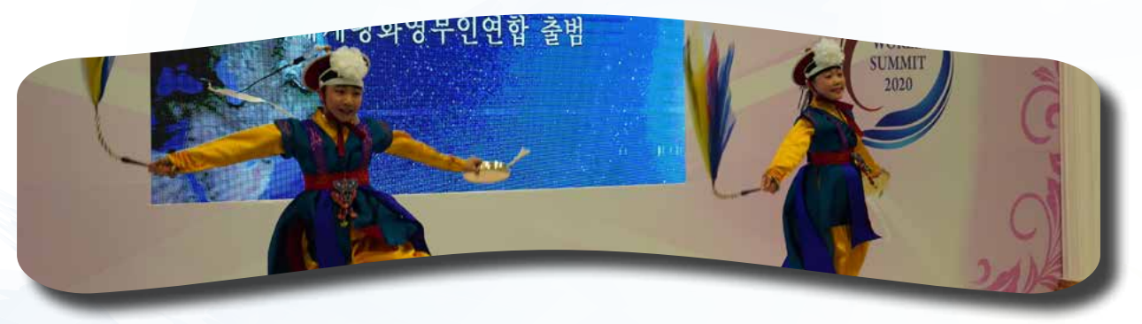
The entertainment of 'Jinsoe Festival' prepared by the Little Angels brought smiles to the participants during the Inaugural Session of the IAFLP