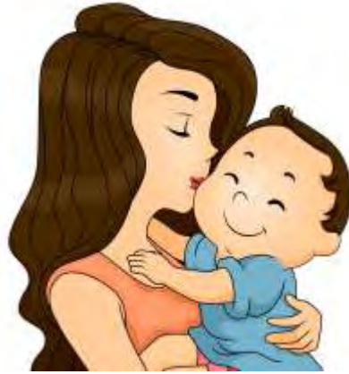
Fertile Period 15-45 years