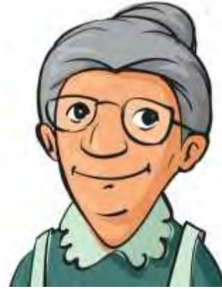
Post-Menopause 45-85 years

Infertile for nearly half our lives... But still sexually active.