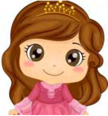
Pre-Menarche 15 years