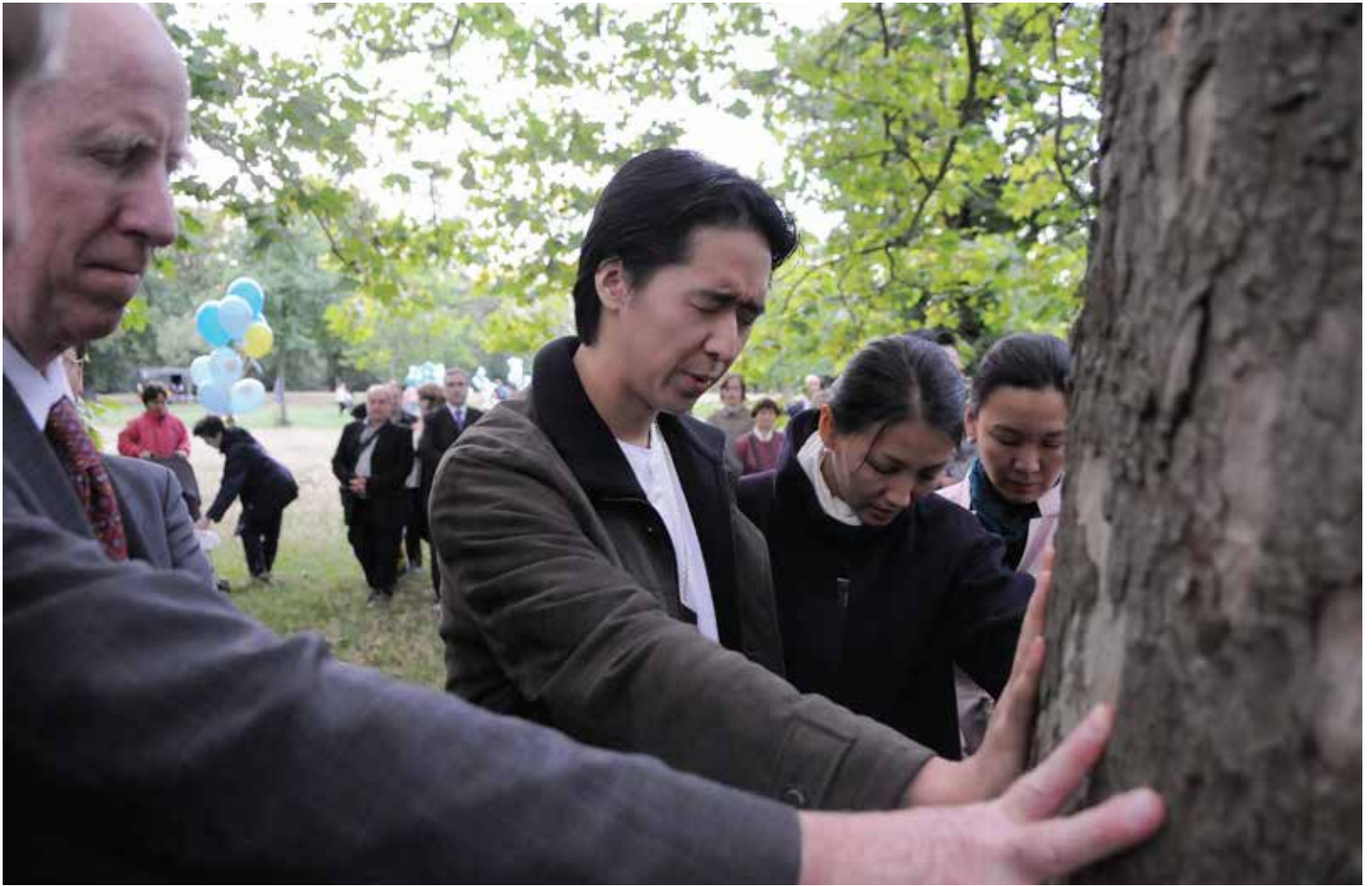
Top: Praying at the Holy Ground which True Father established in in London, Kensington Gardens on July 15, 1965.