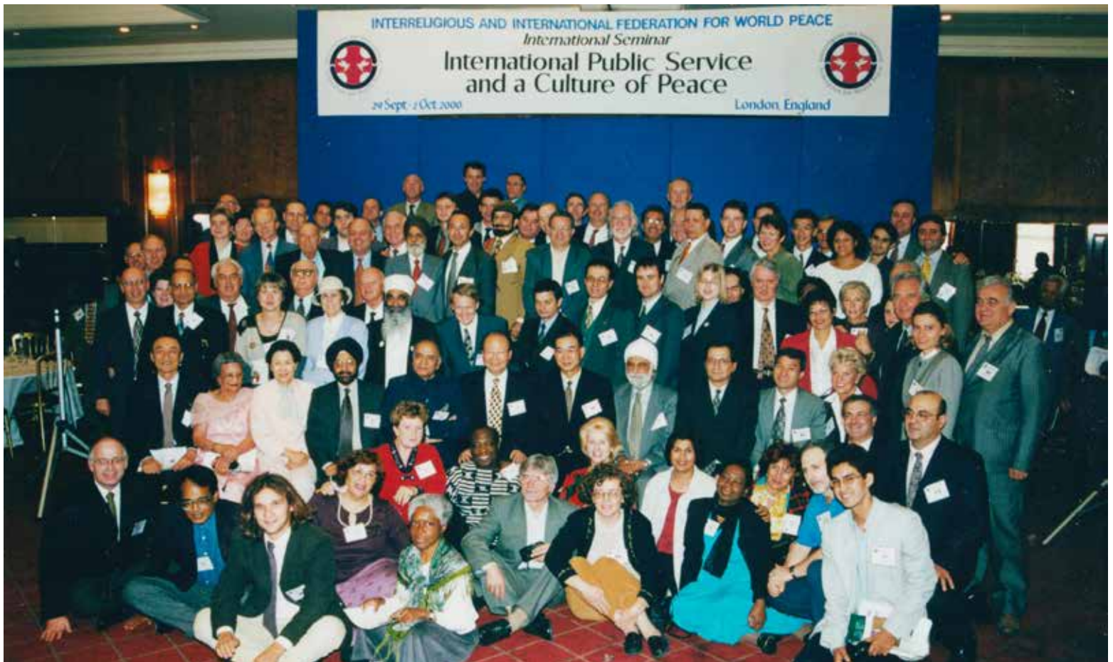
Top: IIFWP International conference in London, September 29 - October 2, 2000.

On January 27, a seminar and Blessing Ceremony was held at the Lancaster Gate headquarters in London with the theme, 'Marriage and Family – Building a Culture of Peace'.