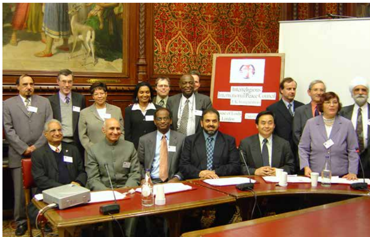
Top: Inauguration of IIPC in UK, House of Lords, London, October 24, 2003.

By the end of January 2003, the two charities of the Sun Myung Moon Foundation and HSAUWC were amalgamated under the new name FFWPU.