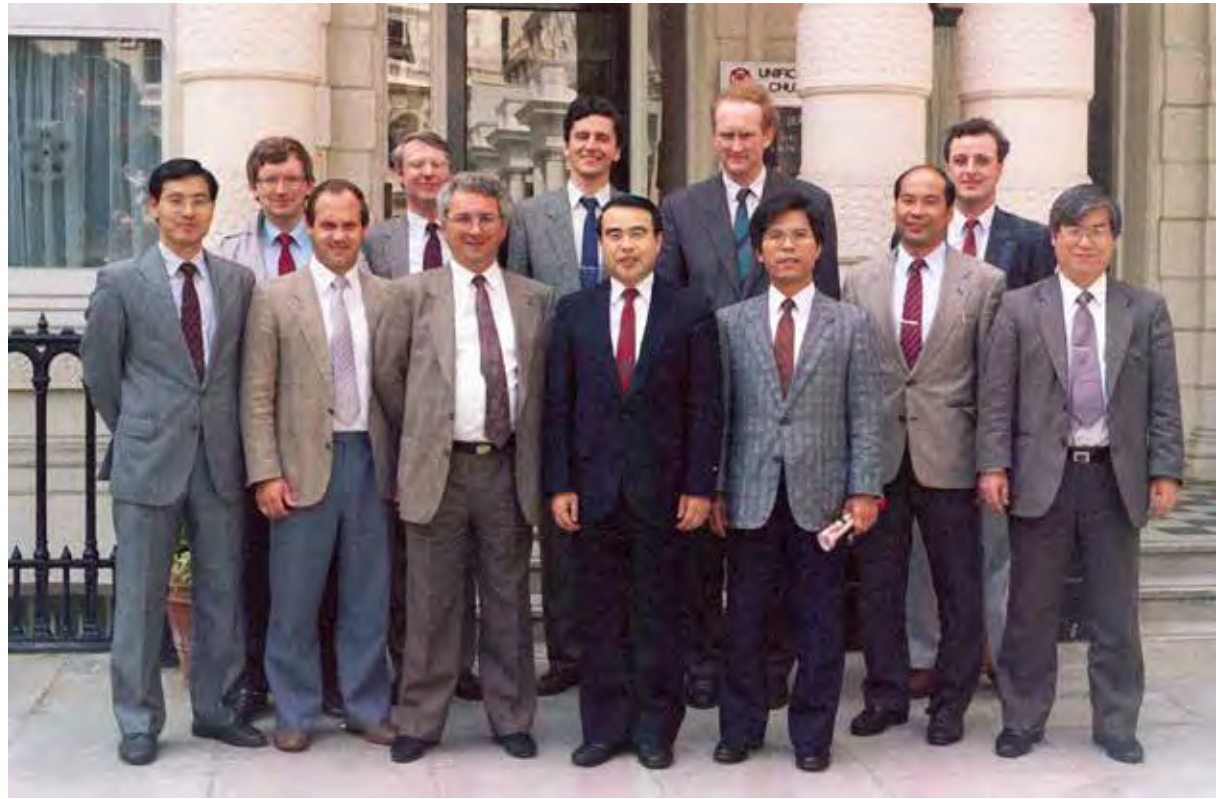
Top: Mr Abe with European leaders outside the London HQ 1990.