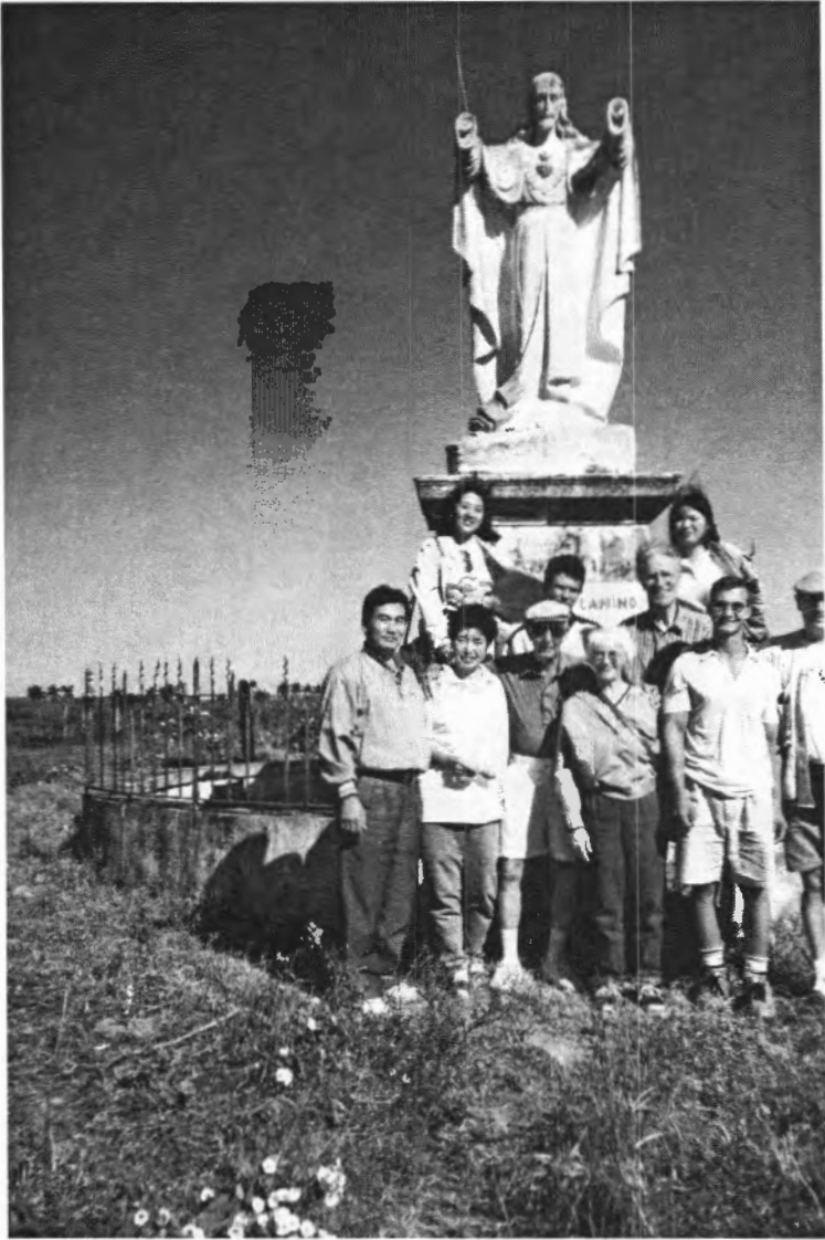
Holy Ground at Sancti Spiritus, Cuba. National Messiahs and supporters.