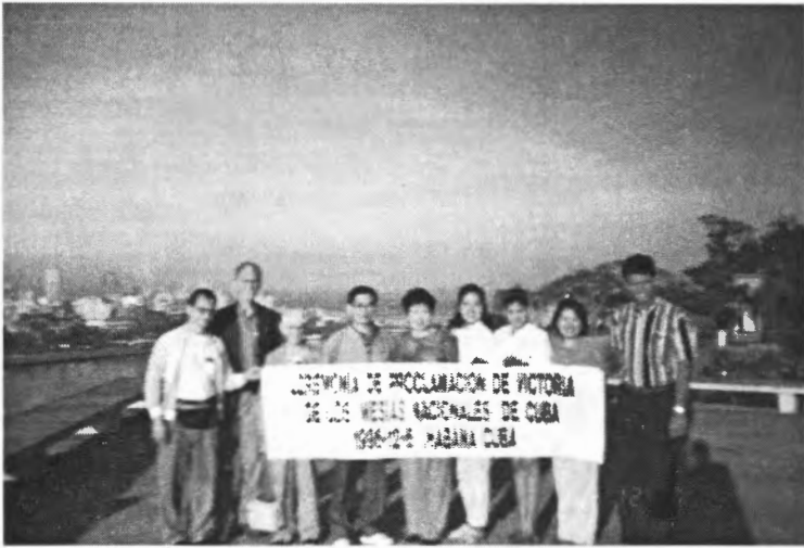
National Messiahs make proclamation overlooking the city of Havana, Cuba.