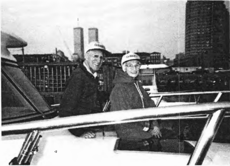
Liberty Harbour, Jersey City, shortly before 9-11-2001.