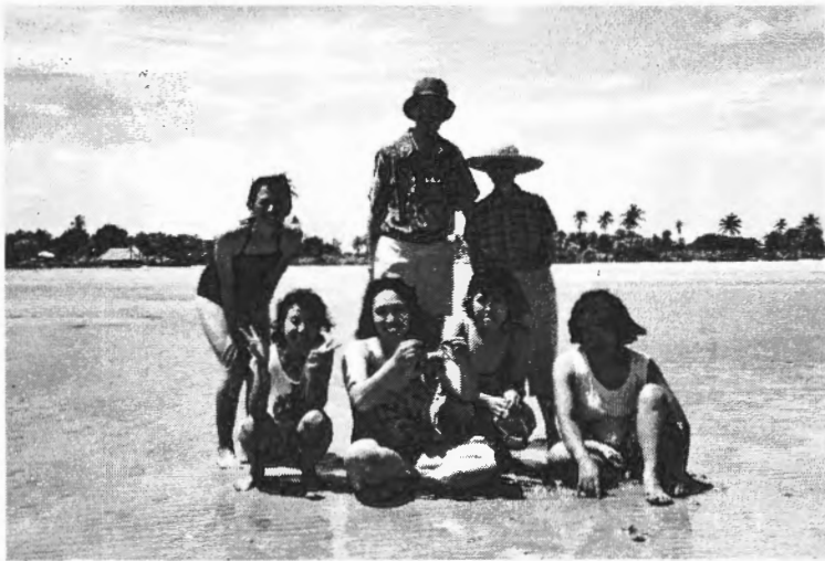
Celebrating Parents' Day, 7-4-1997 at Key Biscayne, Florida, with Japanese missionaries.