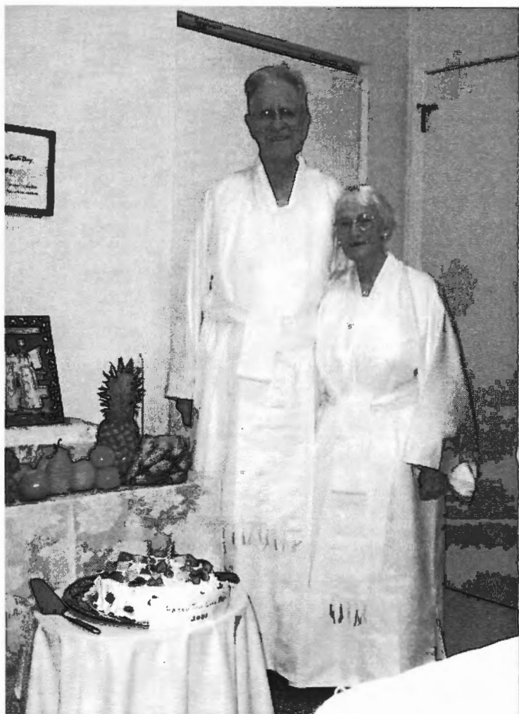
God's Day celebration. First of January 2006