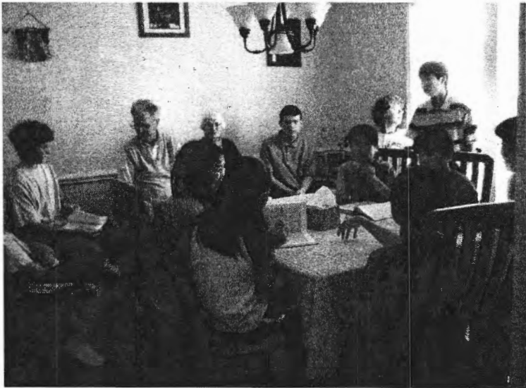
Second Generation preparing for Divine Principle lecture - Chapter 1. North Carolina.